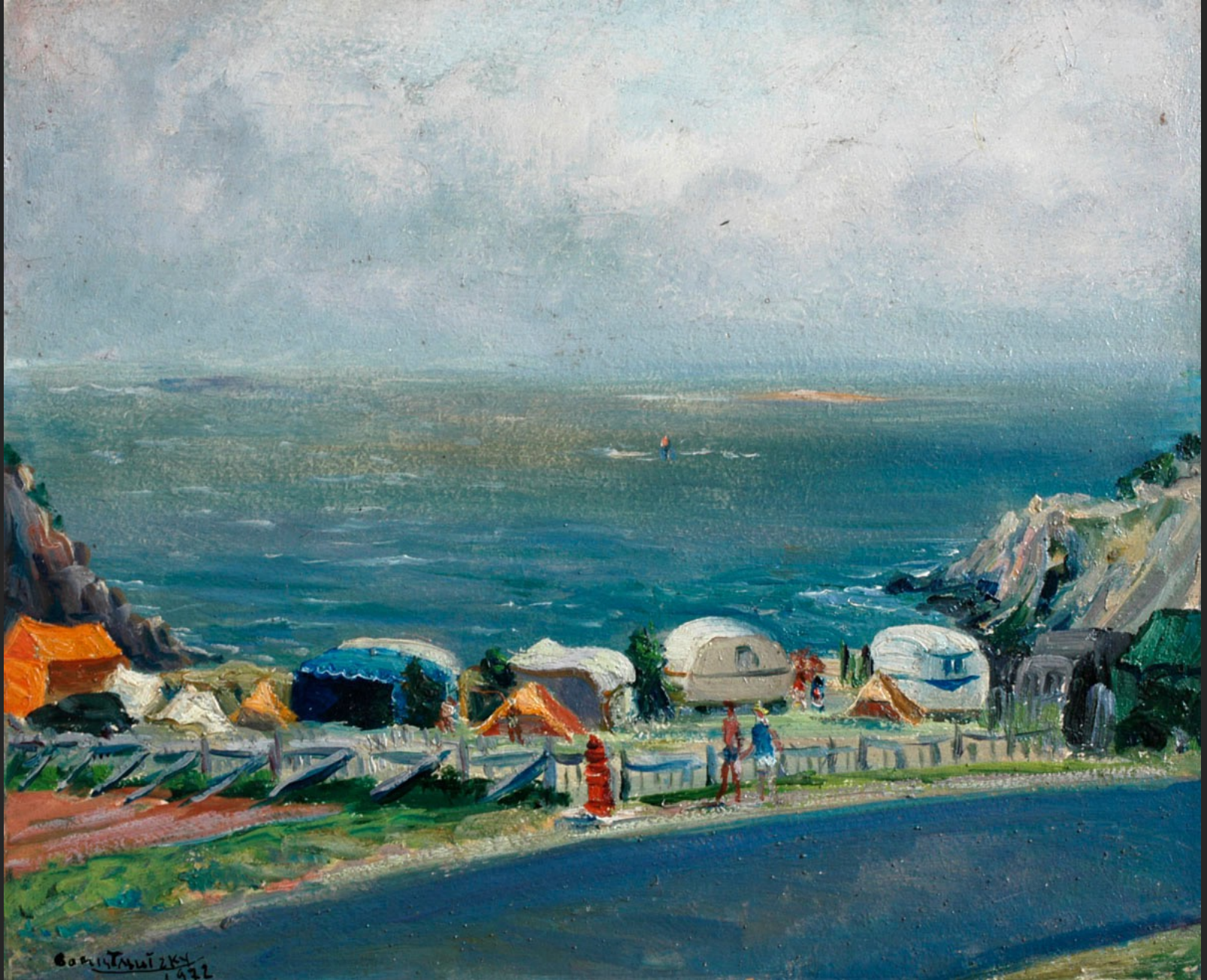
SEASCAPE (CAMPING), 1972, oil on cardboard, 8,7 x 10,6 in