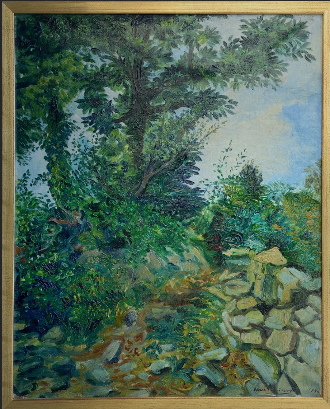
TREE AND LOW WALL IN CORSICA, 1985, oil on canvas, 18,1 x 15 in