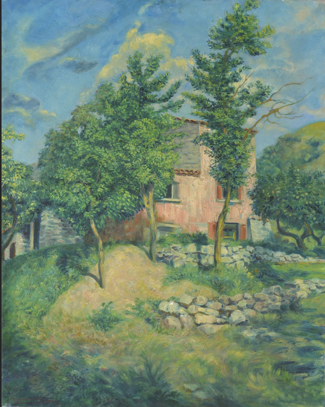
THE TREE, 1970, oil on canvas, 36 x 28,7 in