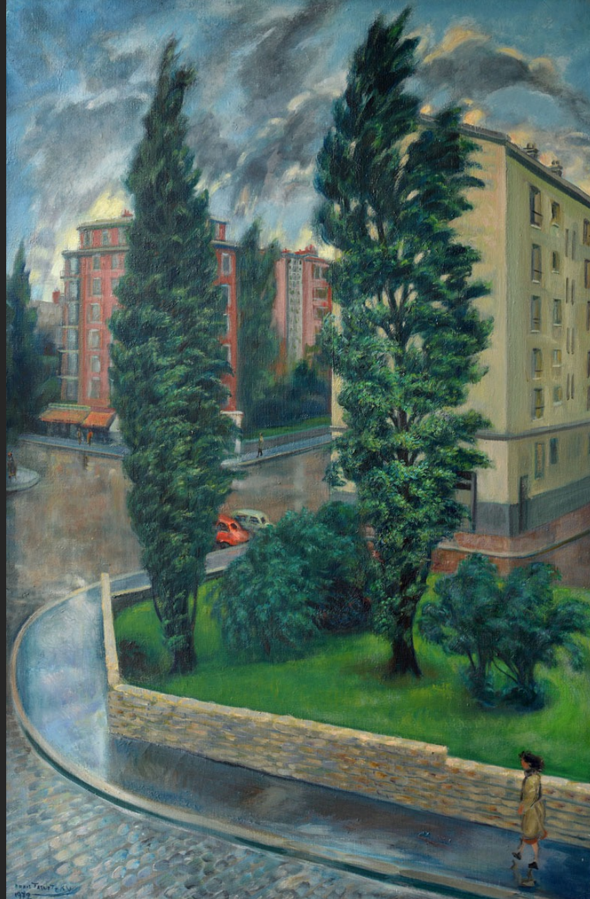
POPLARS, RUE RICAUT, 1972, oil on canvas, 36,2 x 23,6 in