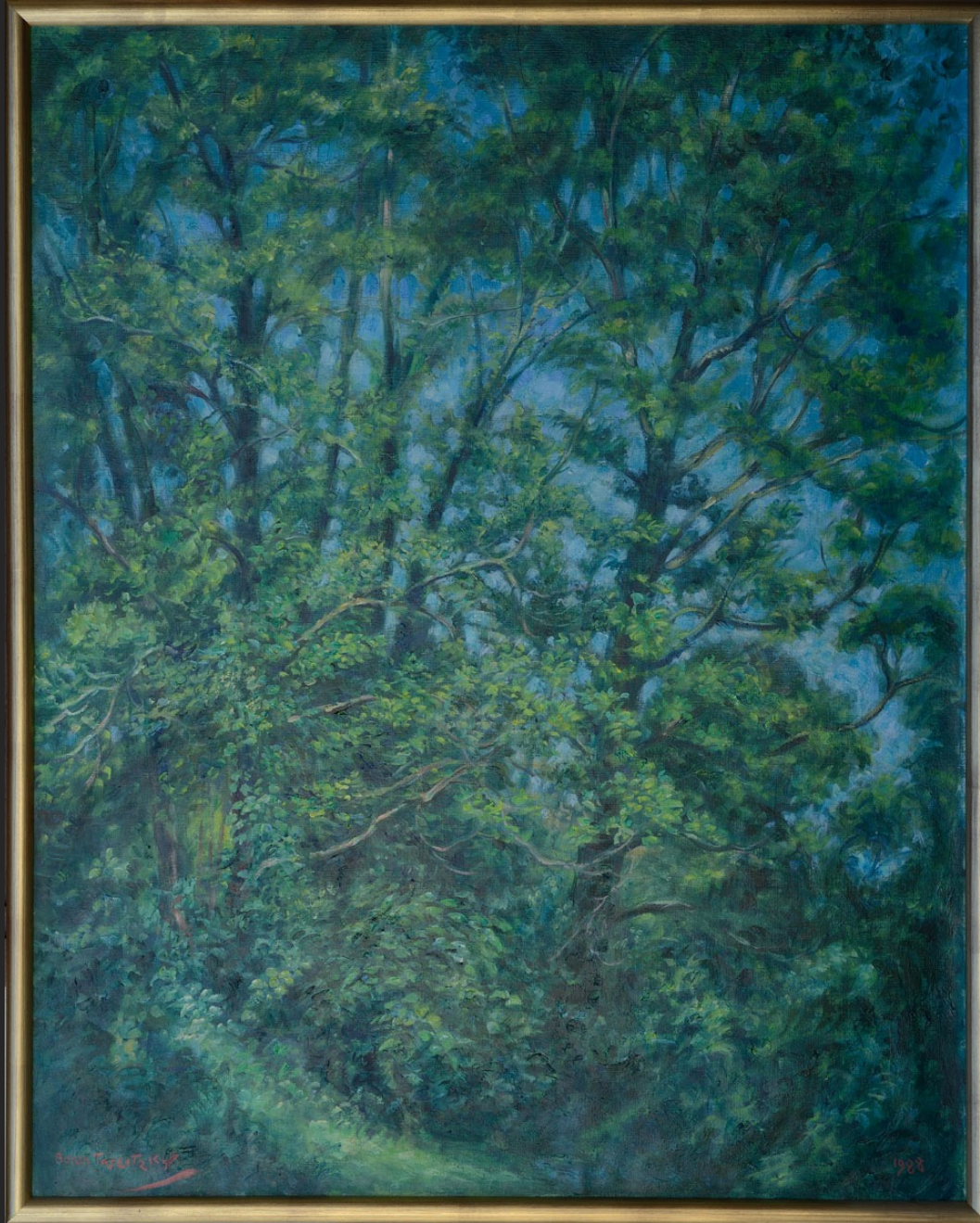
UNDERGROWTH, 1988, oil on canvas, 36,6 x 28,7 in