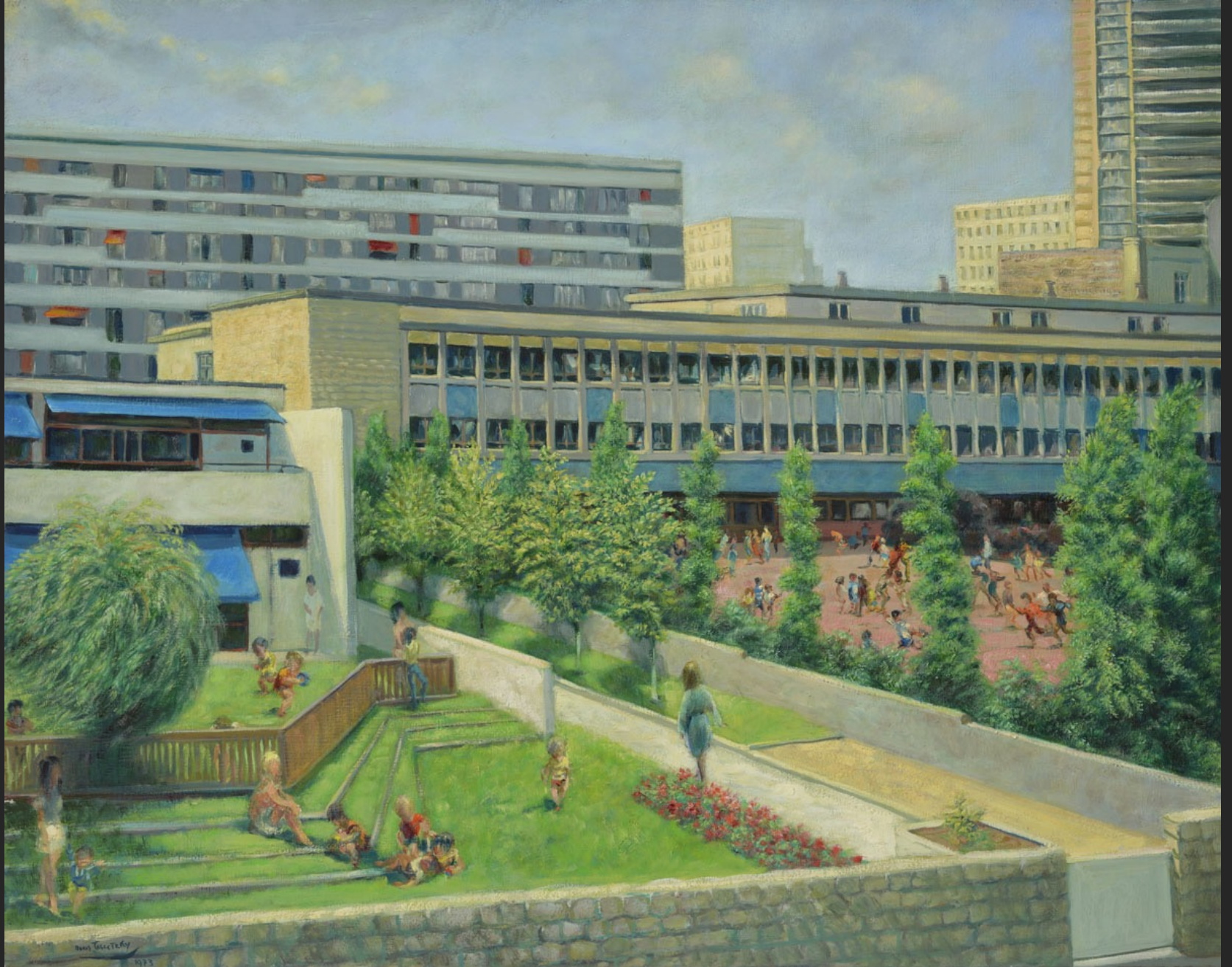
THE NURSERY, RUE RICAUT, 1973, oil on canvas, 28,7 x 36,2 in