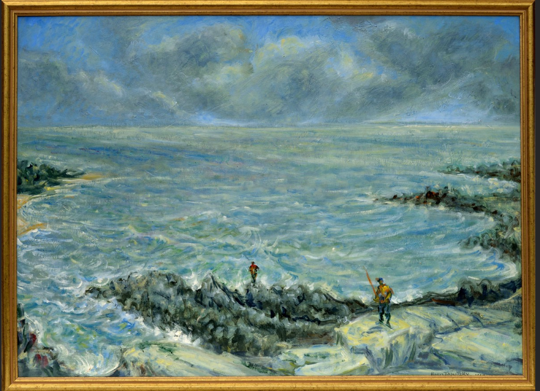
SEASCAPE (SAINT-PALAIS), 1997, oil on canvas board, 19,7 x 27,6 in