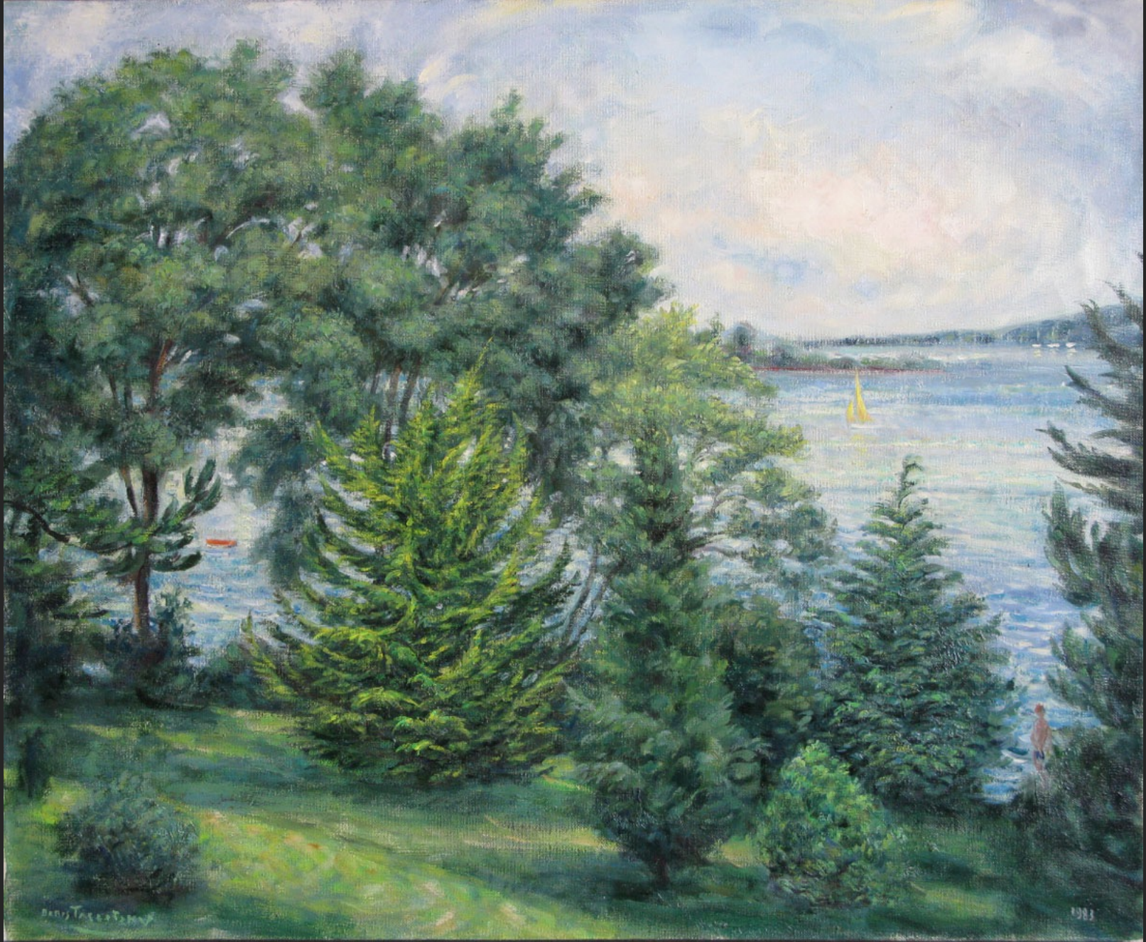
ÎLE-AUX-MOINES LANDSCAPE «TOR PERROQUET», 1983, oil on canvas, 23,6 x 28,7 in