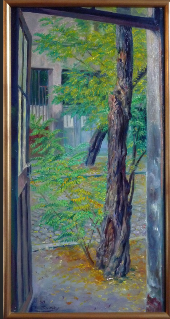
THE ACACIA NEAR THE STUDIO DOOR, 1969, oil on canvas, 31,5 x 15,7 in