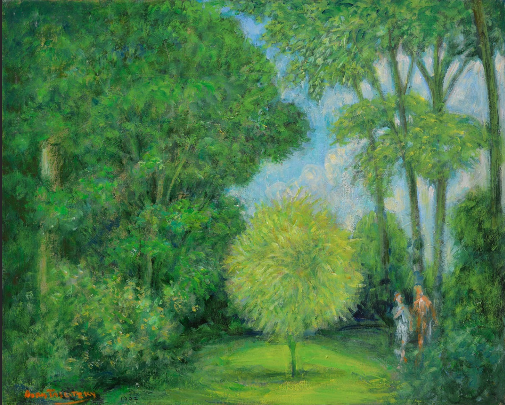
BRITTANY, 1997, oil on canvas, 15,7 x 19,7 in