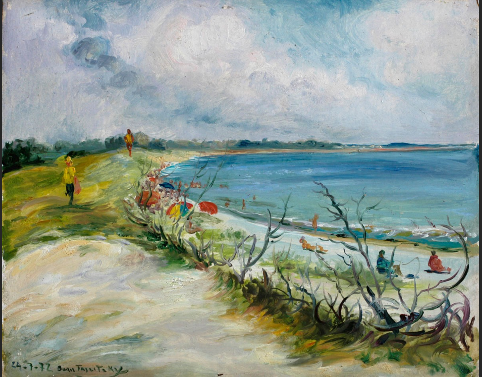
BEACH, July 24th, 1972, oil on plywood, 8,7 x 10,6 in