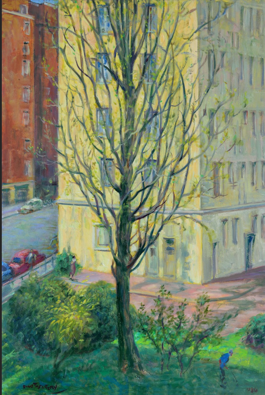
THE POPLAR, 1974, oil on canvas, 28,7 x 19,7 in