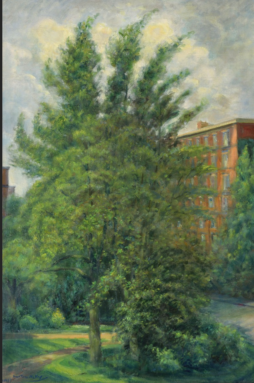
RICAUT SQUARE, 1977, oil on canvas, 31,9 x 25,6 in