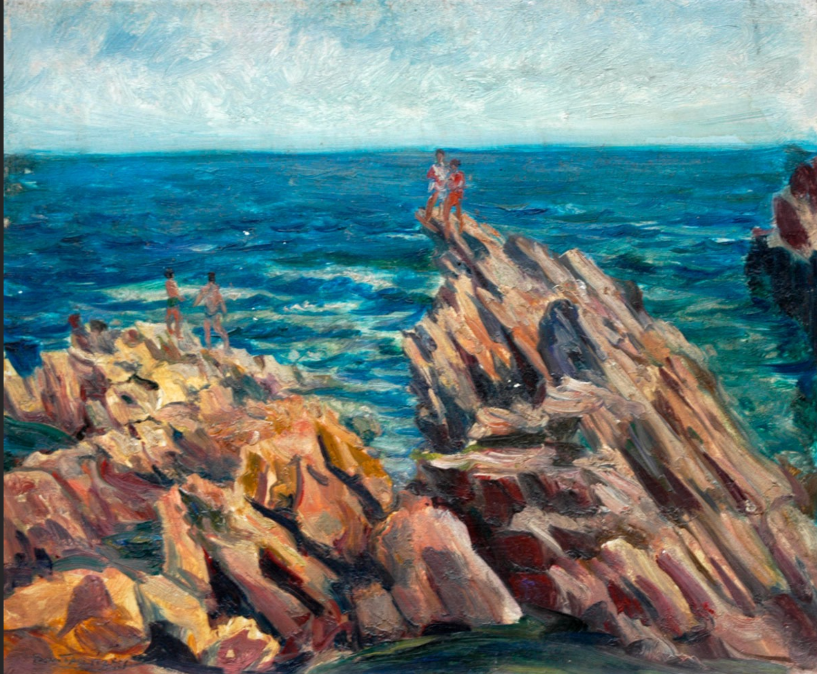
SAINT-RAPHAËL, undated, oil on cardboard, 8,7 x 10,6 in