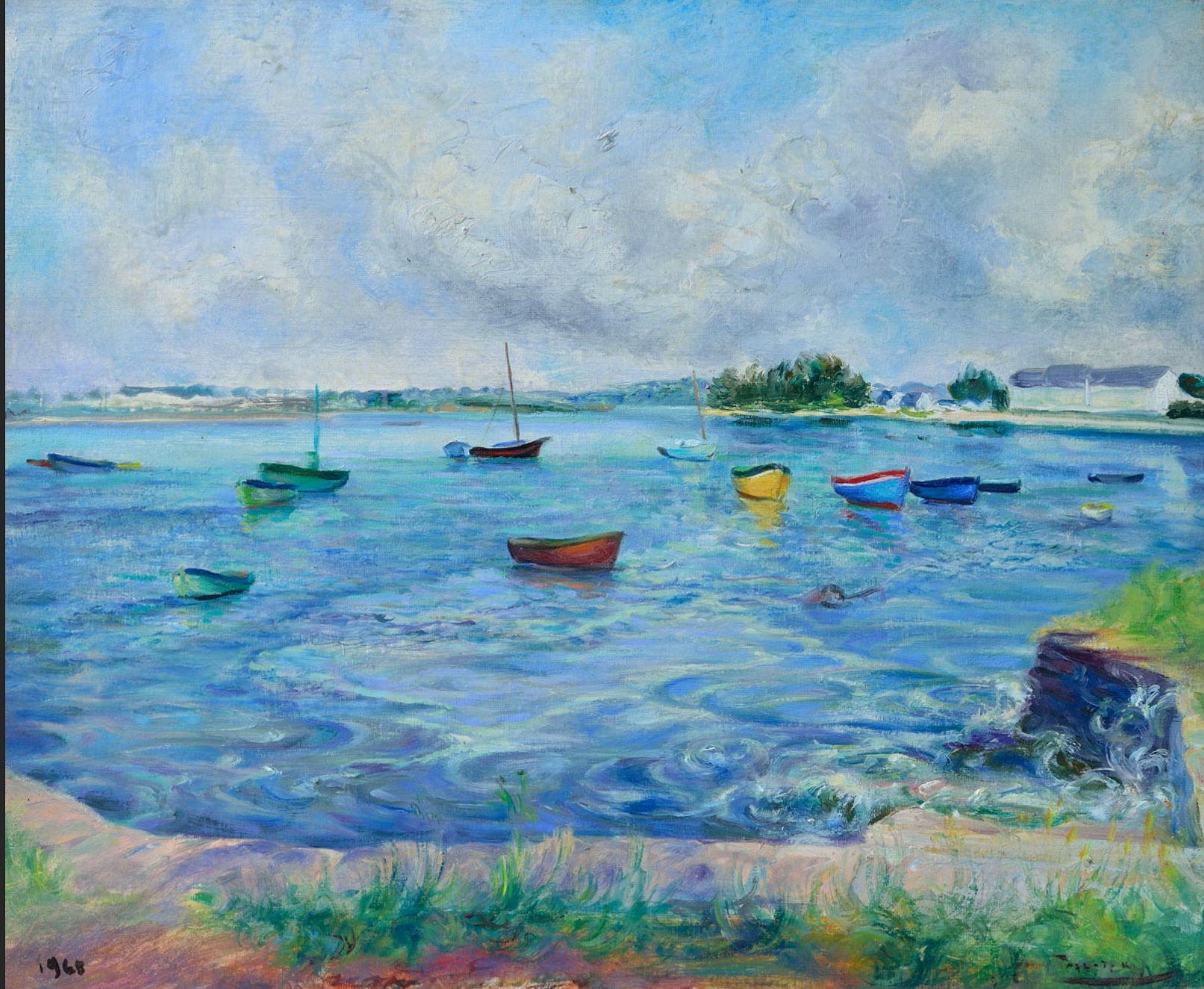
SMALL BOATS IN BRITTANY, 1968, oil on canvas, 19,7 x 24 in