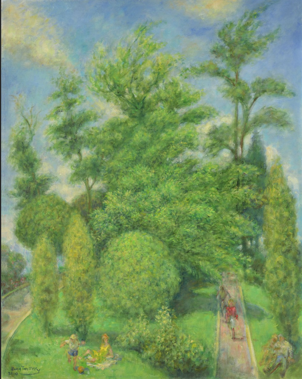
SILHOUETTES IN A LANDSCAPE (1), 2000, oil on canvas, 36,2 x 28,7 in