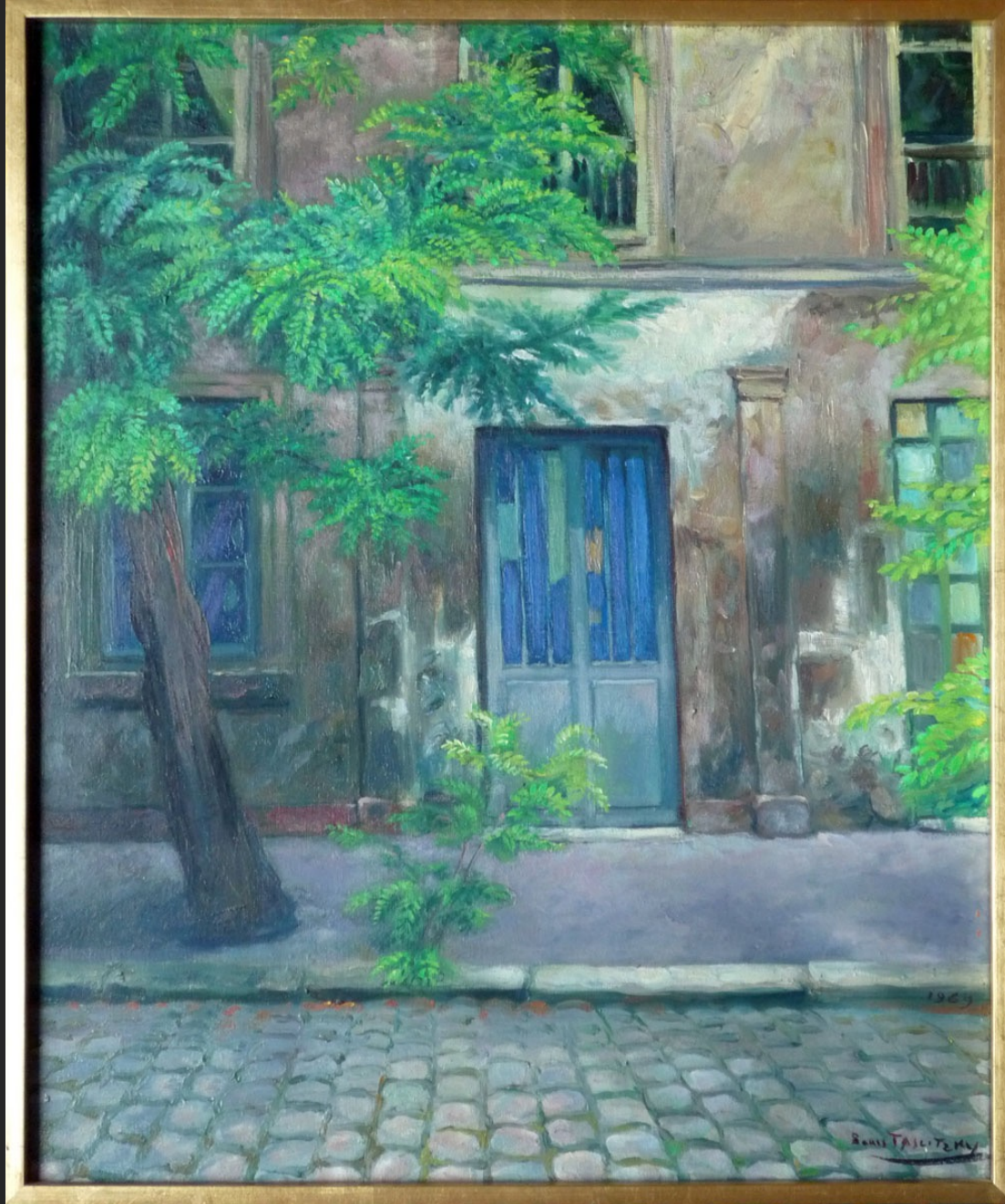
THE STUDIO YARD, RUE CAMPAGNE-PREMIÈRE, 1969, oil on canvas, 21,7 x 18,1 in