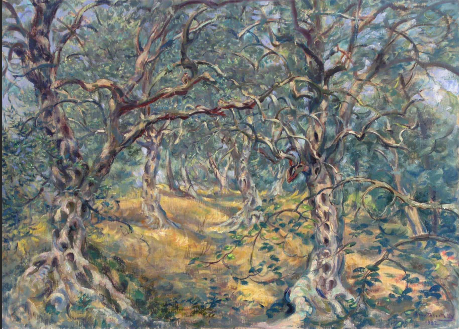
OLIVE TREES (CORFU), 1982, oil on canvas, 23,6 x 31,5 in