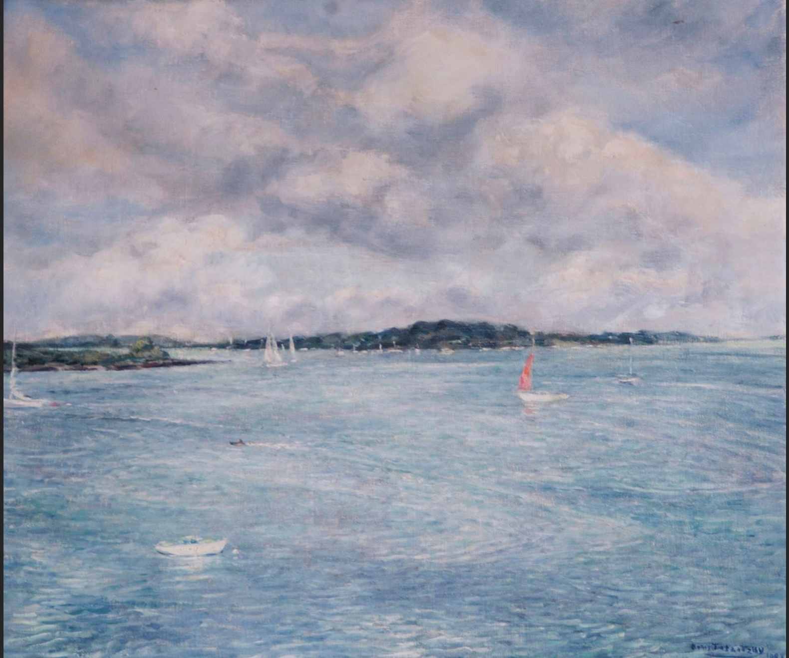
MARINE, 1983, oil on canvas, 21,7 x 25,6 in