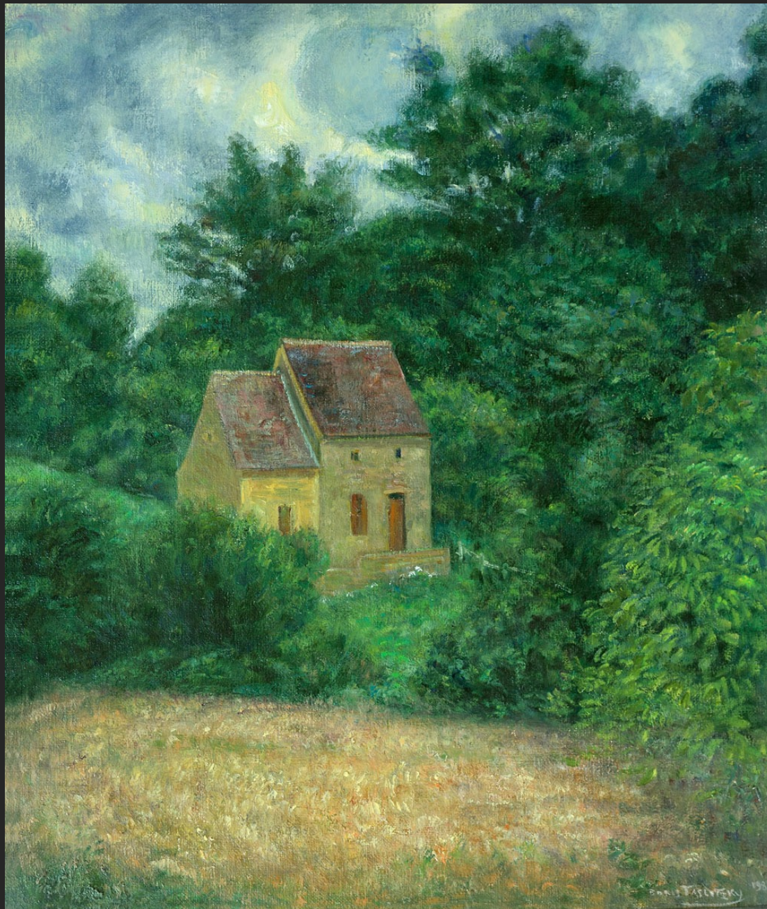
THE LOT, 1981, oil on canvas, 21,7 x 18,1 in