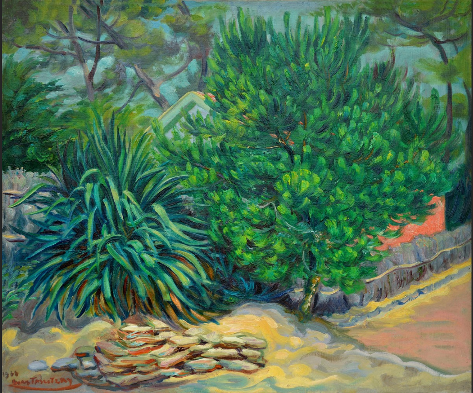
LANDSCAPE, 1966, oil on canvas, 18,1 x 21,7 in