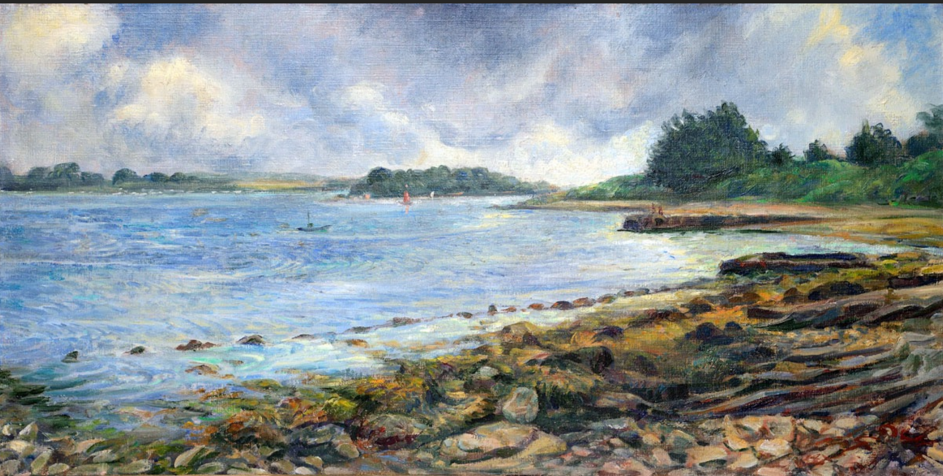
LA POINTE DU TRECH', L'ÎLE-AUX-MOINES, 1981, oil on canvas, 11,8 x 23,6 in