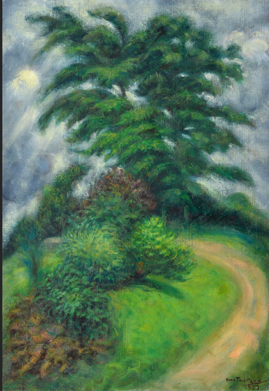
LANDSCAPE, 1977, oil on canvas, 55 x 38 in