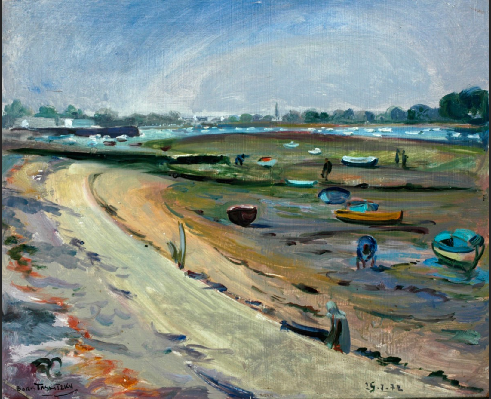
MARINE, 25th July 1972, oil on plywood, 8,7 x 10,6 in