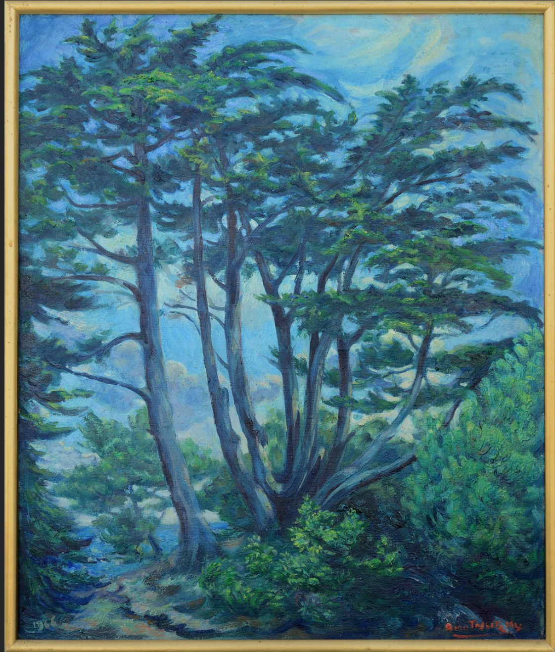
TREE IN SAINT-BREVIN-LES-PINS, 1966, oil on canvas, 21,7 x 18,1 in