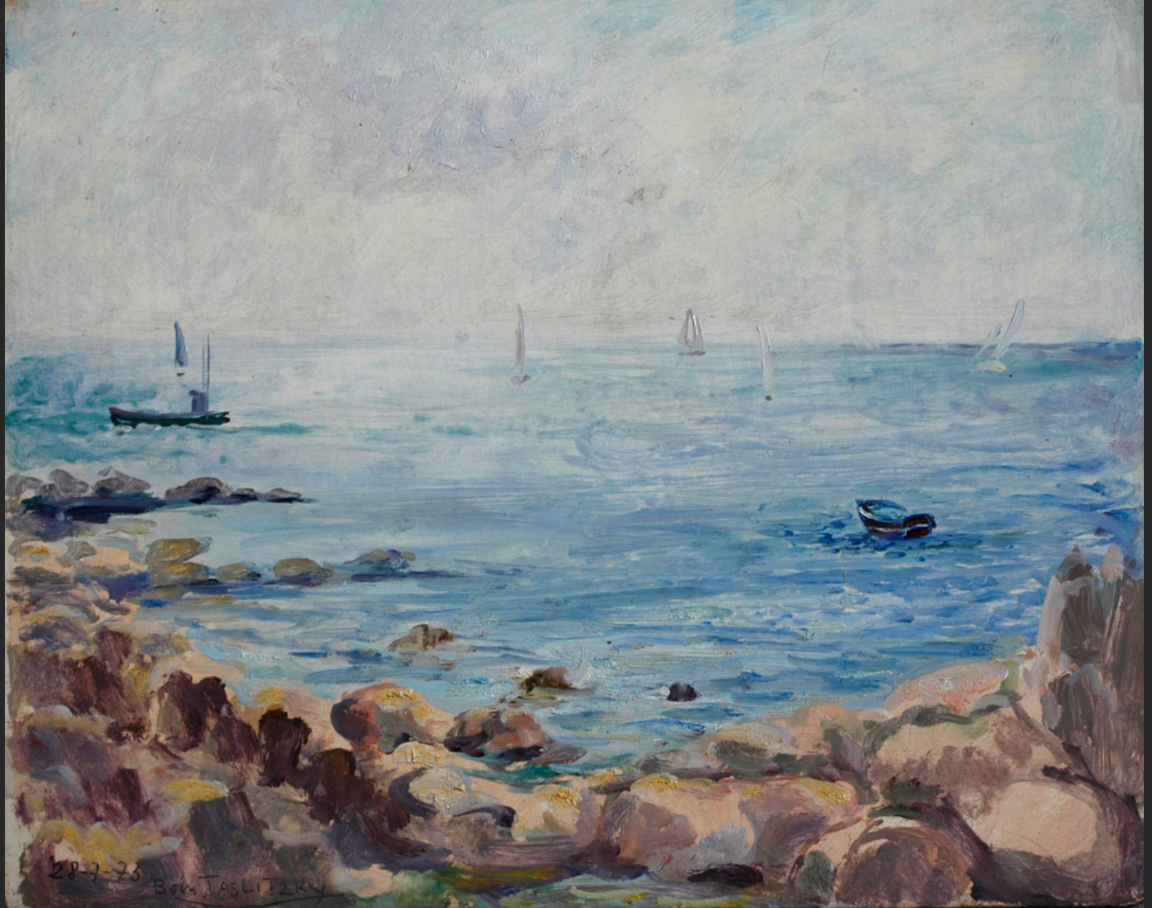
MARINE, 28th July 1972, oil on plywood, 8,7 x 10,6 in