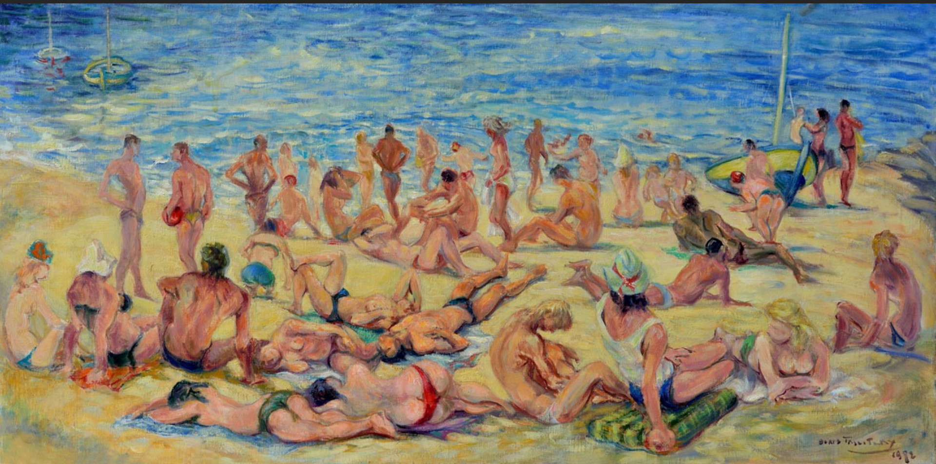
THE BEACH I, 1982, oil on canvas, 13,8 x 27,6 in