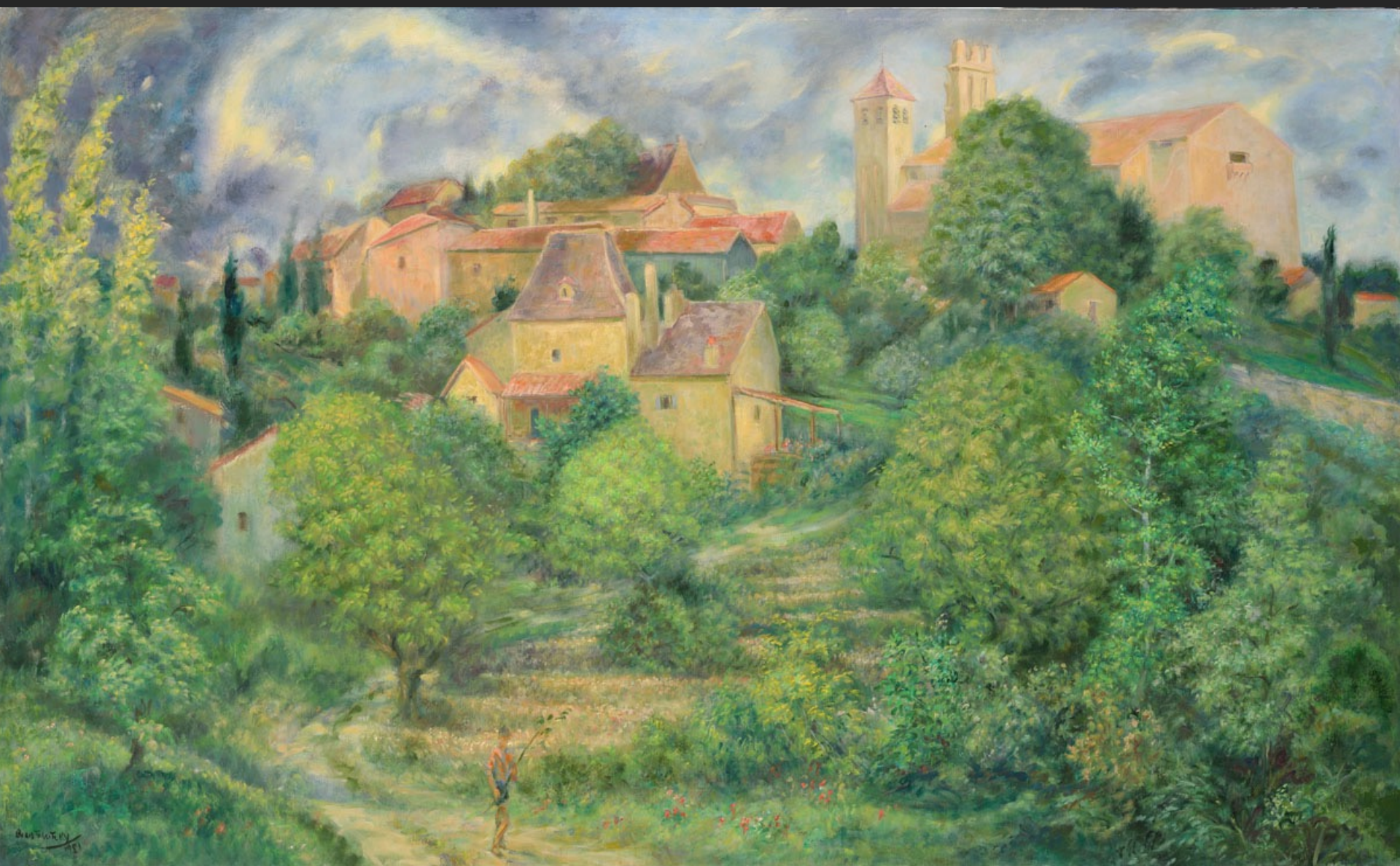
DORDOGNE, 1981, oil on canvas, 38,2 x 63,8 in