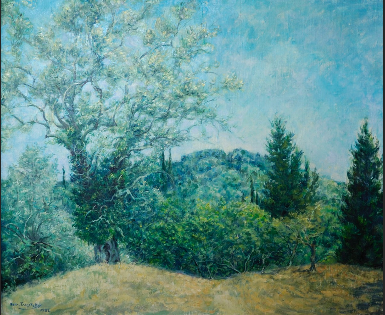
CORFU, 1982, oil on canvas, 23,6 x 28,7 in