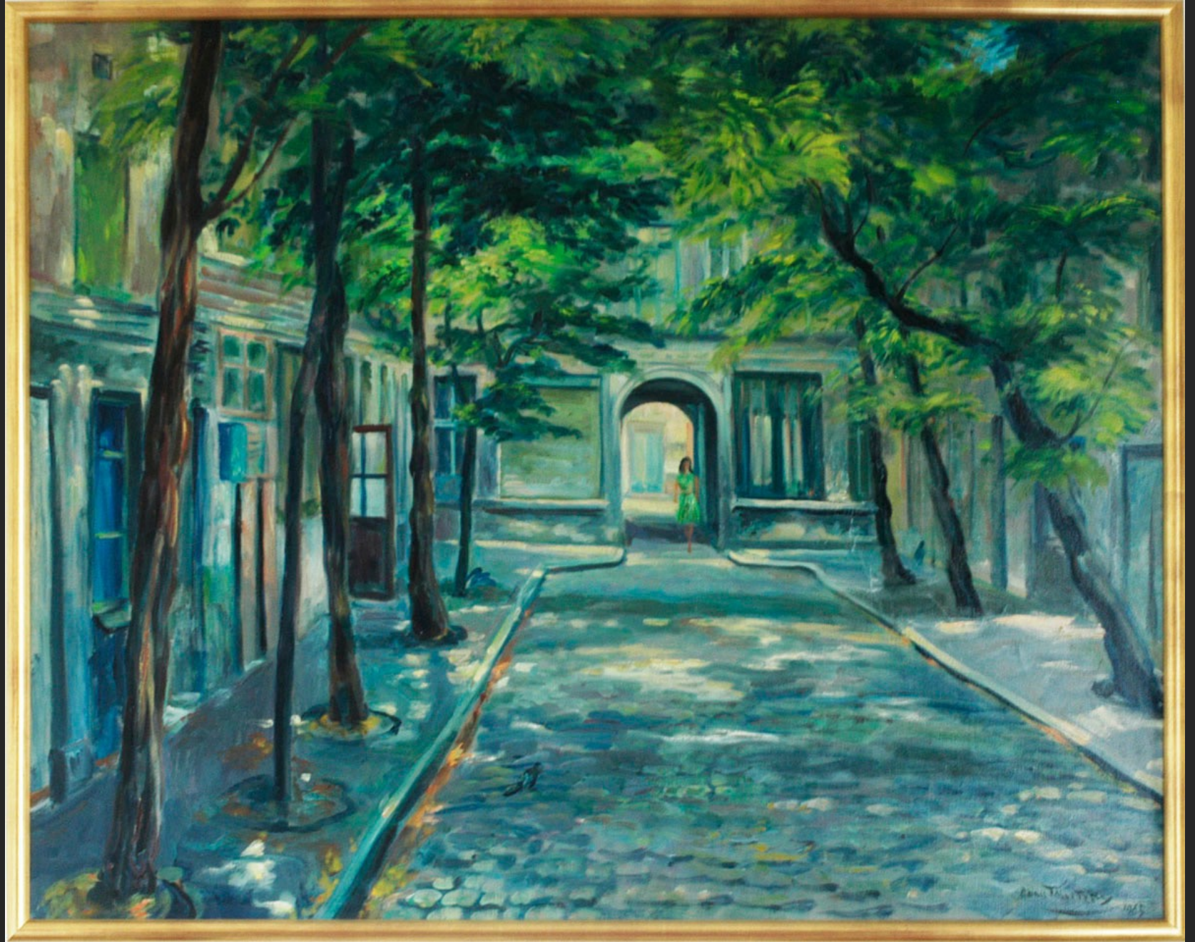
THE STUDIO YARD, RUE CAMPAGNE-PREMIÈRE, 1967, oil on canvas, 31,5 x 39,4 in