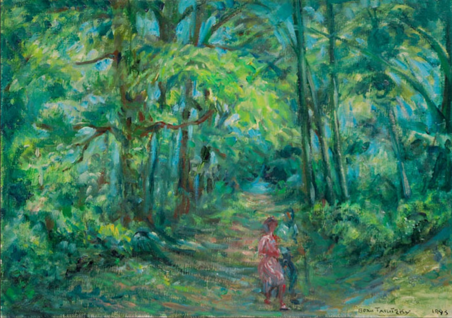
TWO WALKERS IN UNDERGROWTH, LANDSCAPE IN LOT, 1993, oil on canvas pasted on cardboard, 9,8 x 13,8 in