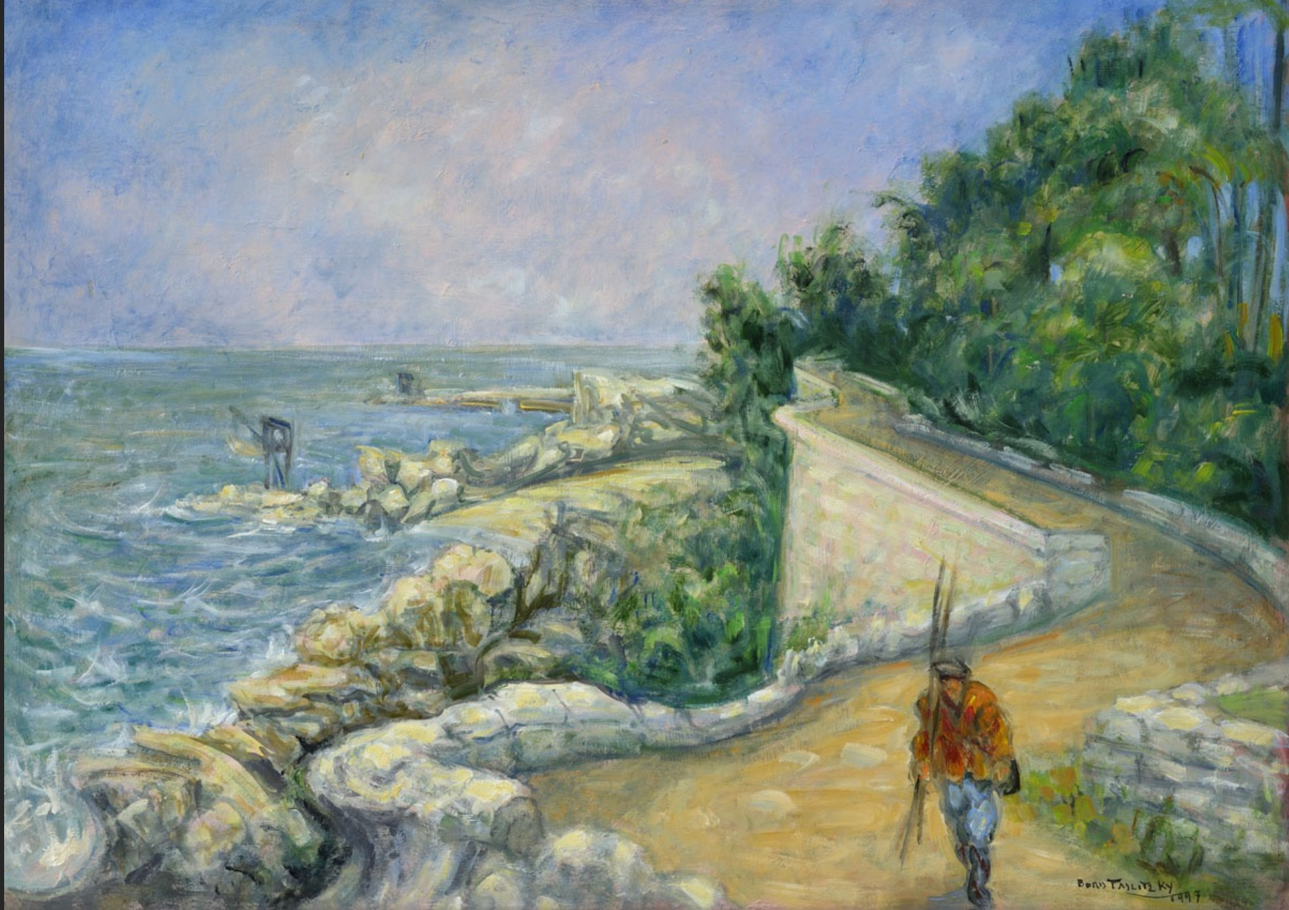
SEASIDE (SAINT-PALAIS), 1997, oil on canvas board, 19,7 x 27,6 in