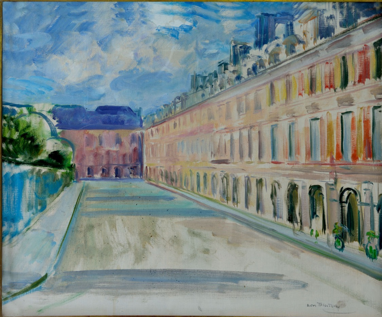
PLACE DES VOSGES ( PAINTING APPEARING WITH BORIS IN A SCENE OF THE MOVIE «PARIS BRÛLE-T-IL ?»), 1966, oil on canvas, 18,1 x 21,7 in