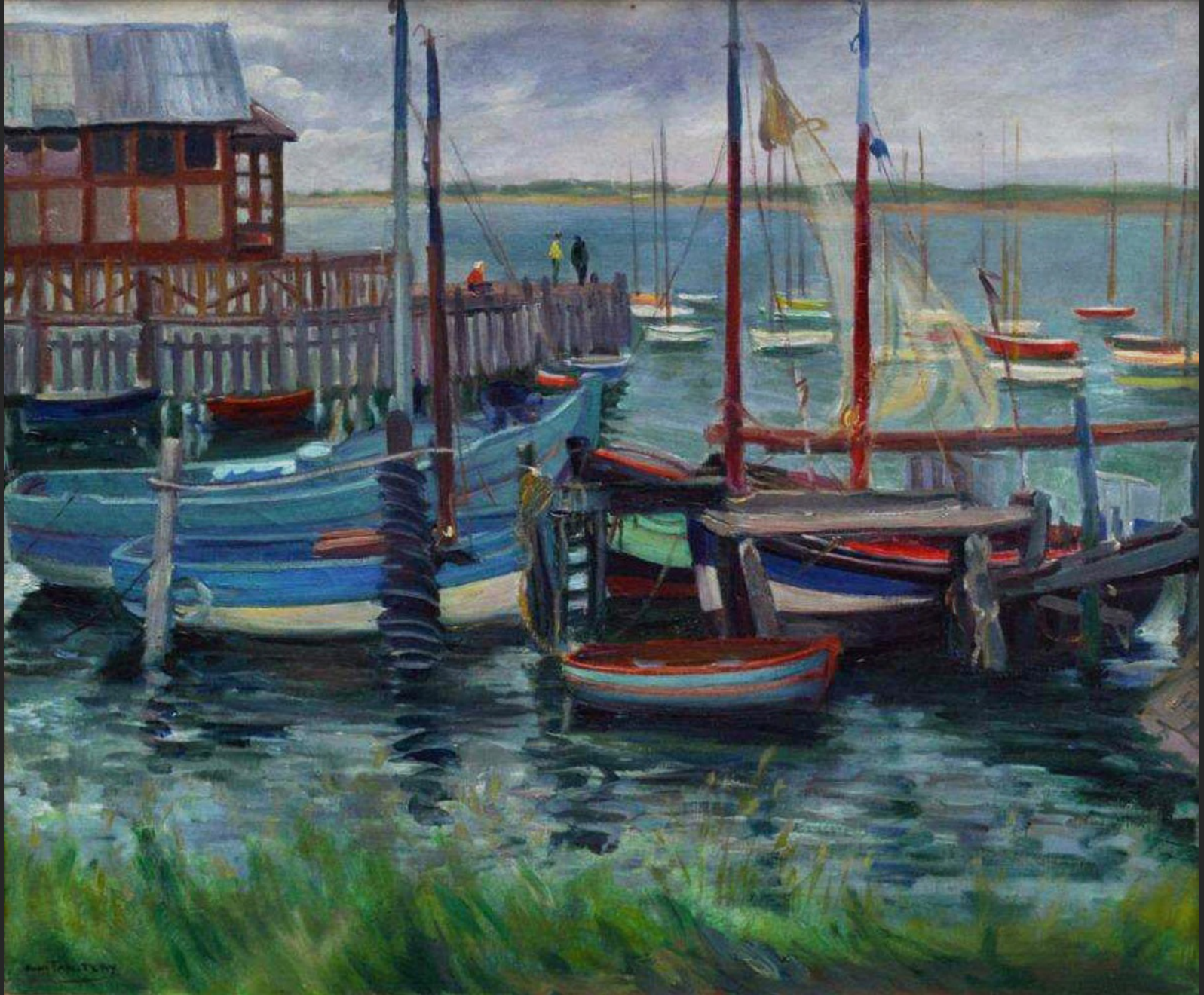
BOATS IN NORMANDY, undated, oil on canvas, 19,7 x 24 in