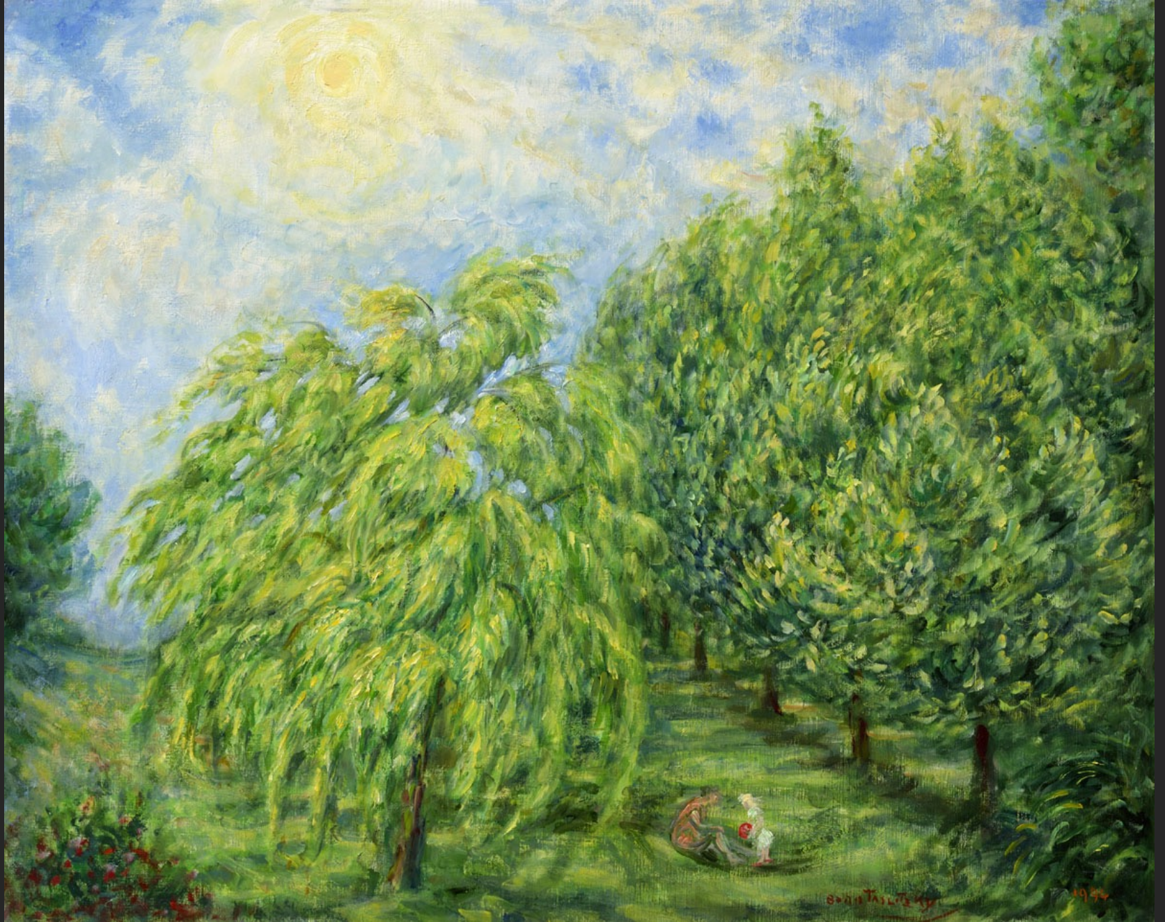
THE WILLOW, 1994, oil on canvas, 25,6 x 31,9 in