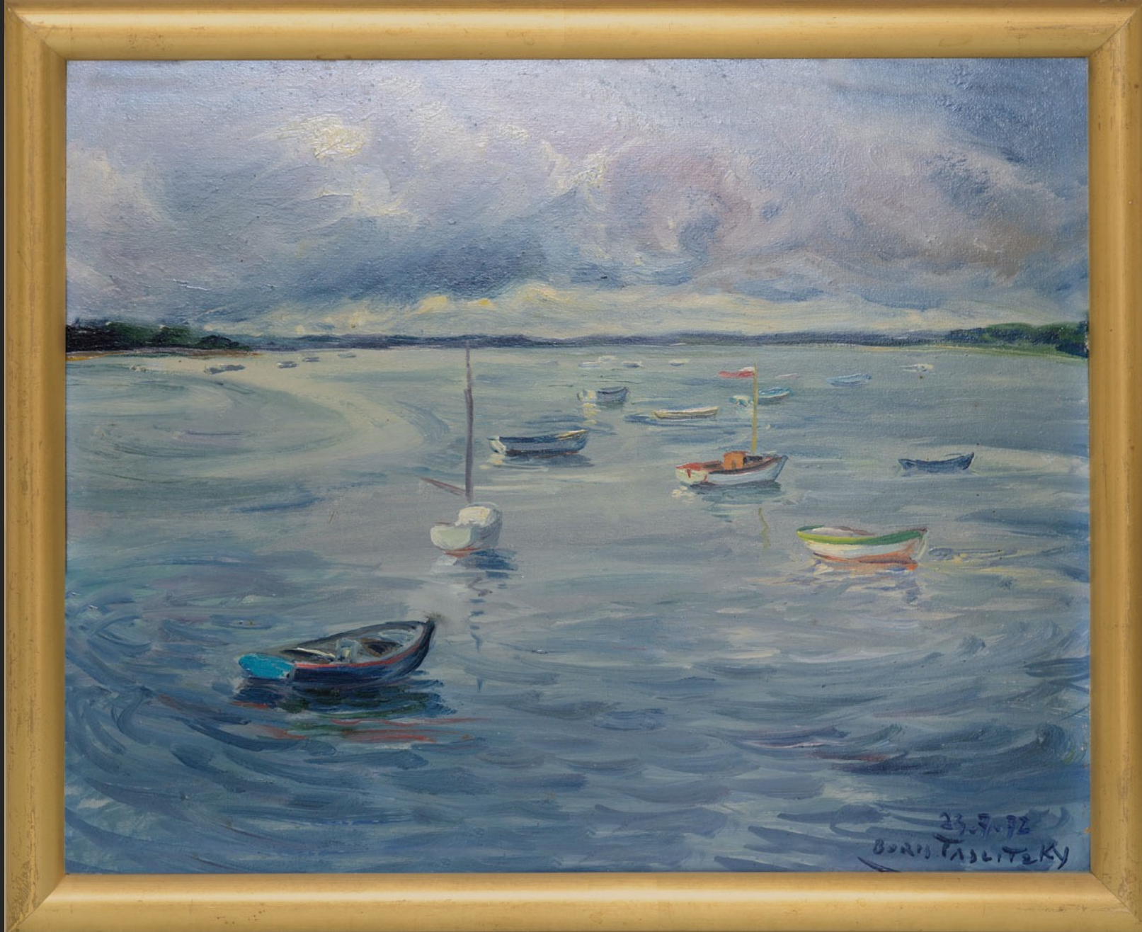
MARINE, July 23rd, 1972, oil on cardboard, 8,7 x 10,6 in