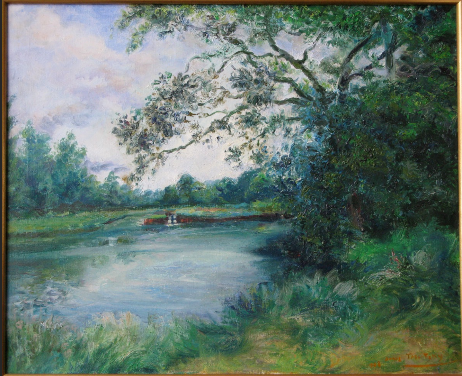
THE POND OF CAP COZ, 1968, oil on canvas, 19,7 x 24 in