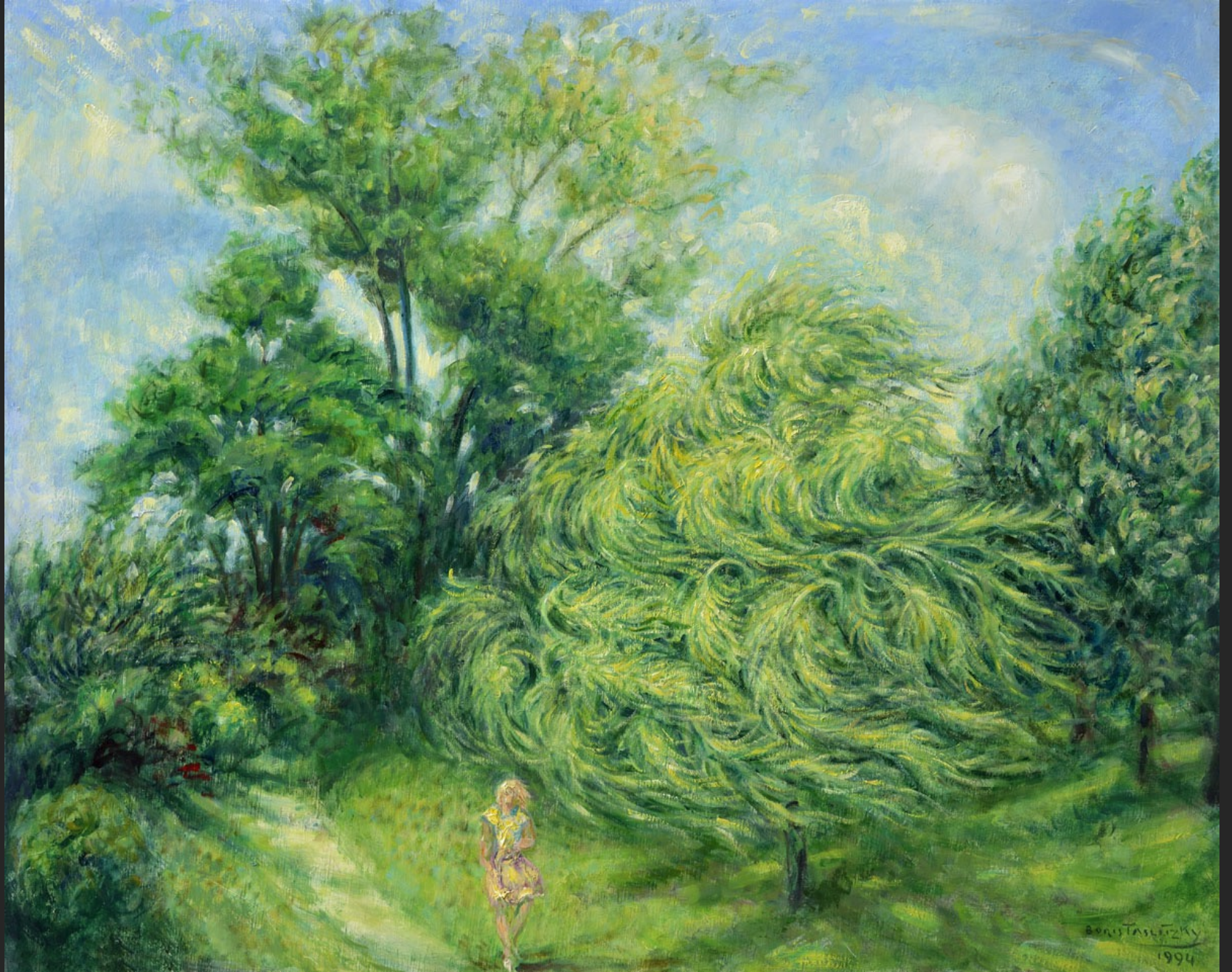
YOUNG GIRL BY THE WEEPING WILLOW, 1994, oil on canvas, 25,6 x 31,9 in