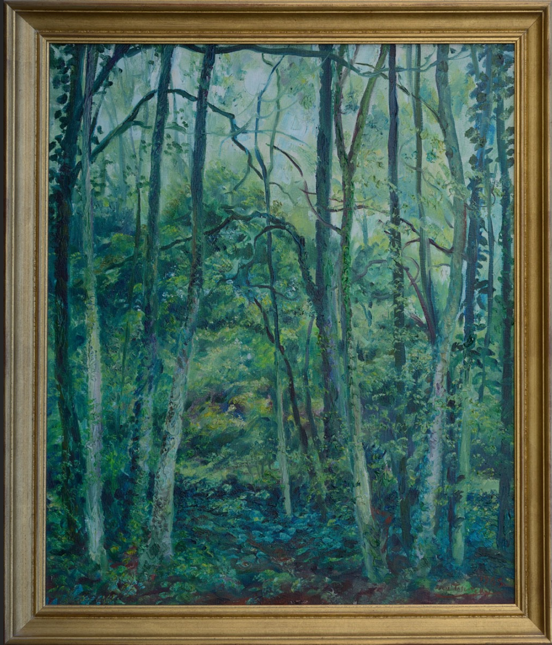
UNDERGROWTH, 1965, oil on canvas, 21,7 x 18,1 in