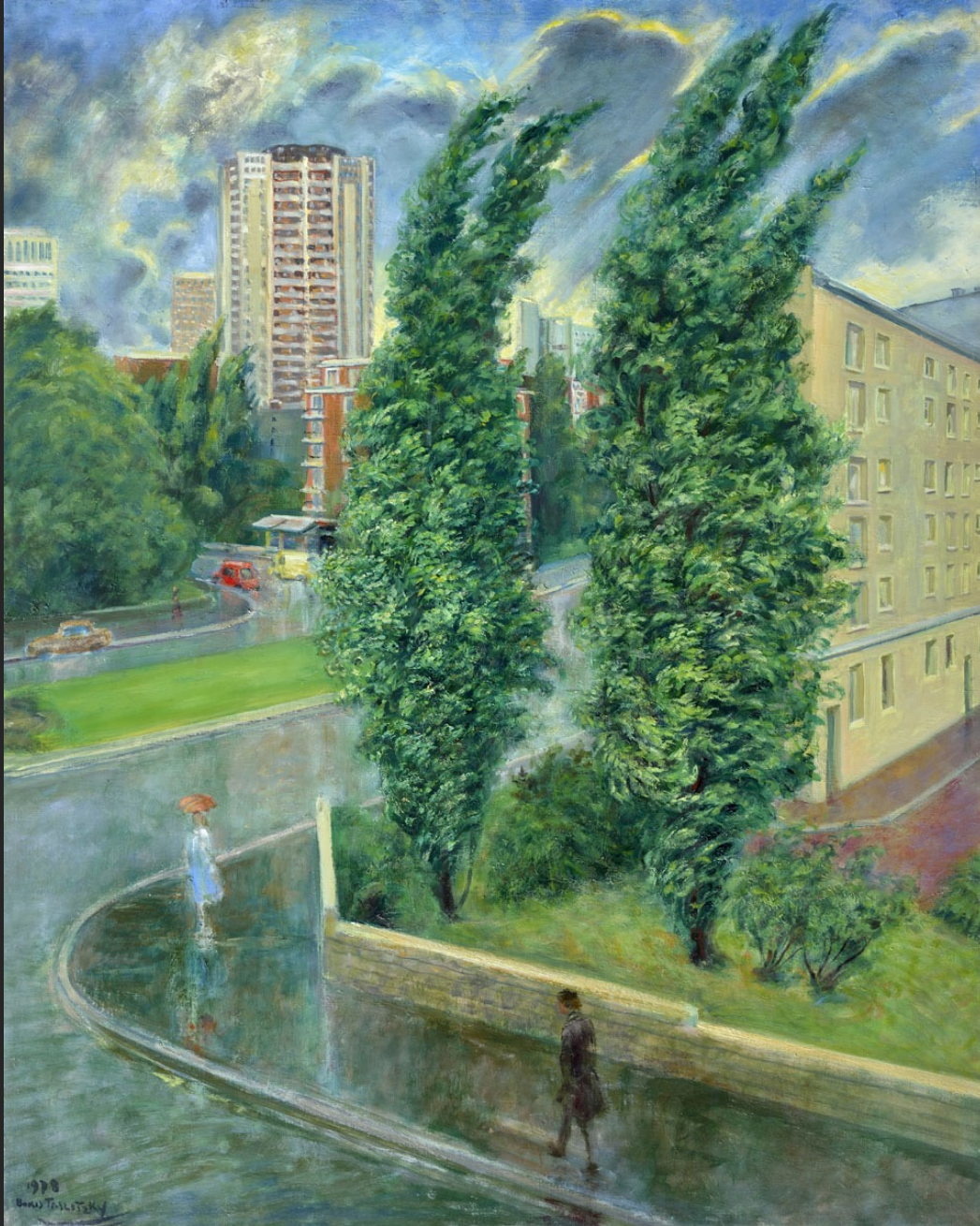
POPLARS, RUE RICAUT, 1978, oil on canvas, 31,9 x 25,6 in