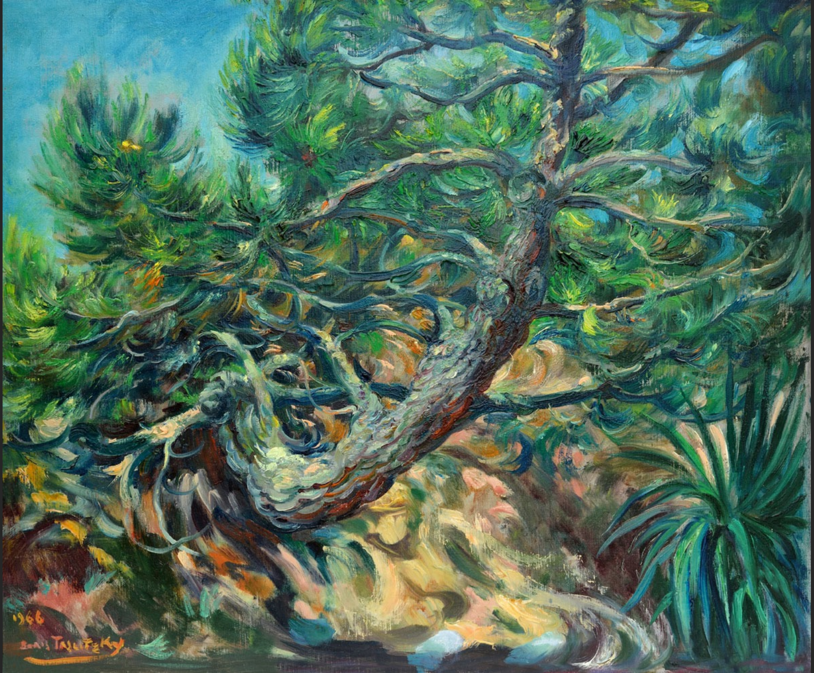
BRITTANY, 1966, oil on canvas, 18,1 x 21,7 in