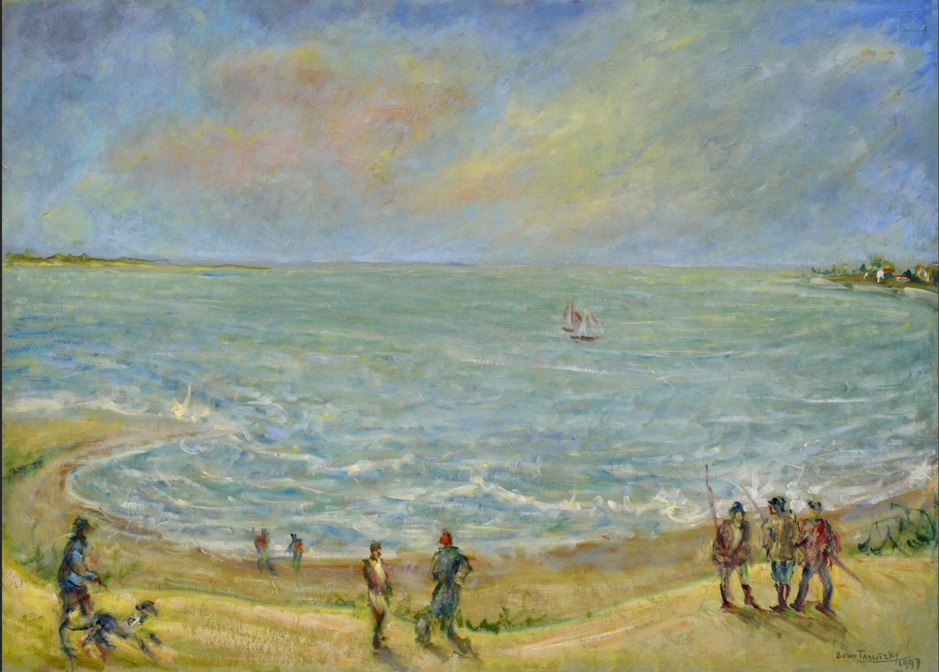
MARINE, 1997, oil on canvas board, 19,7 x 27,6 in