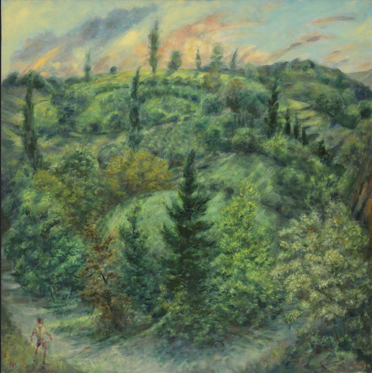
LANDSCAPE IN DORDOGNE, 1980, oil on canvas, 31,5 x 31,5 in