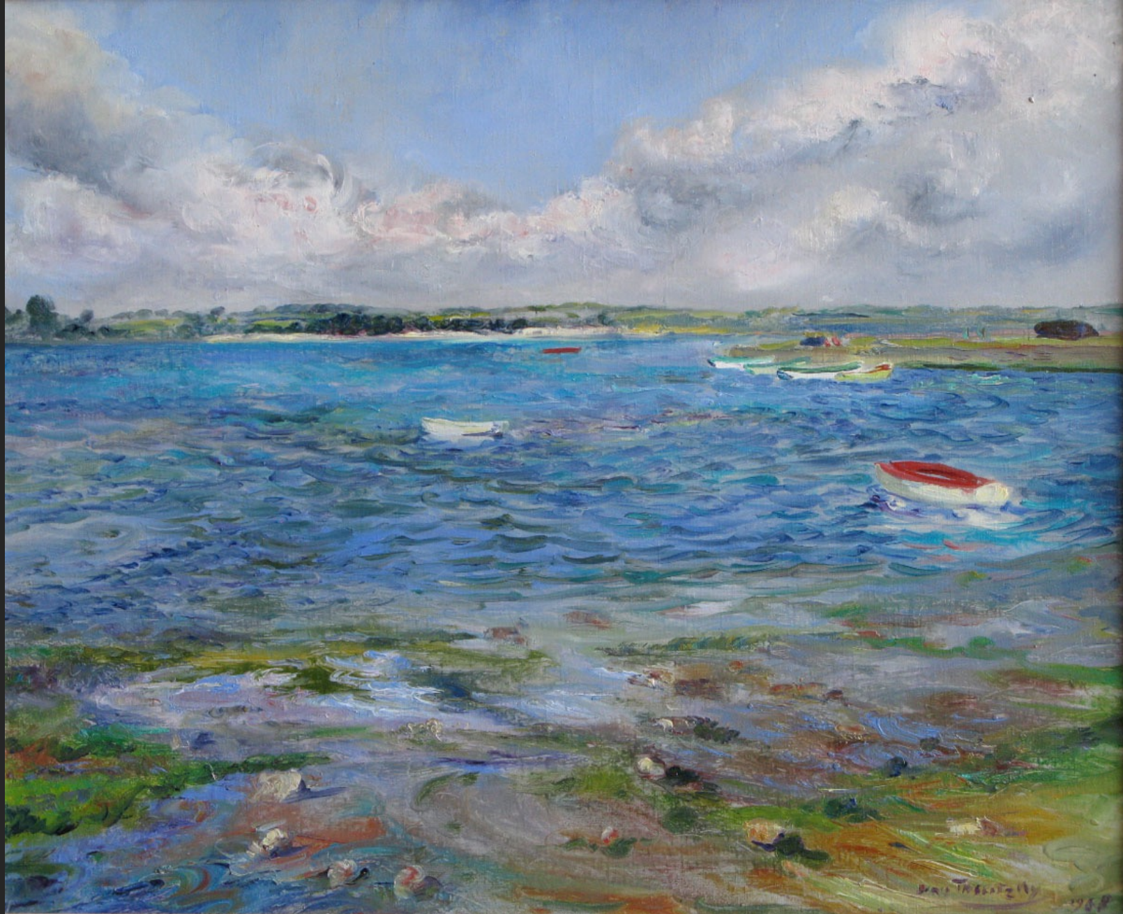
MARINE IN CAP COZ, 1968, oil on canvas, 19,7 x 24 in