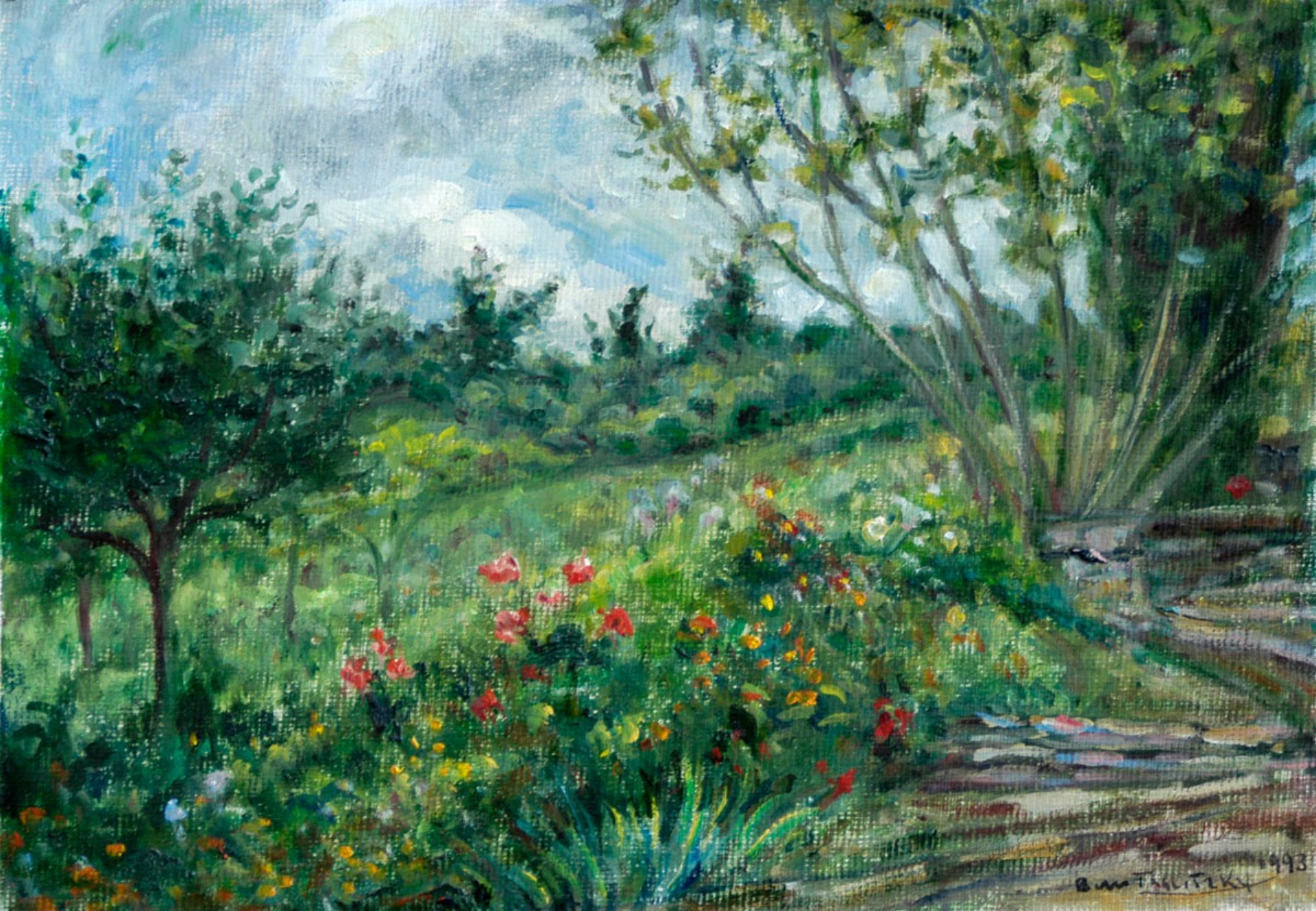
LANDSCAPE IN LOT (FONS), 1993, oil on canvas board, 9,8 x 13,8 in