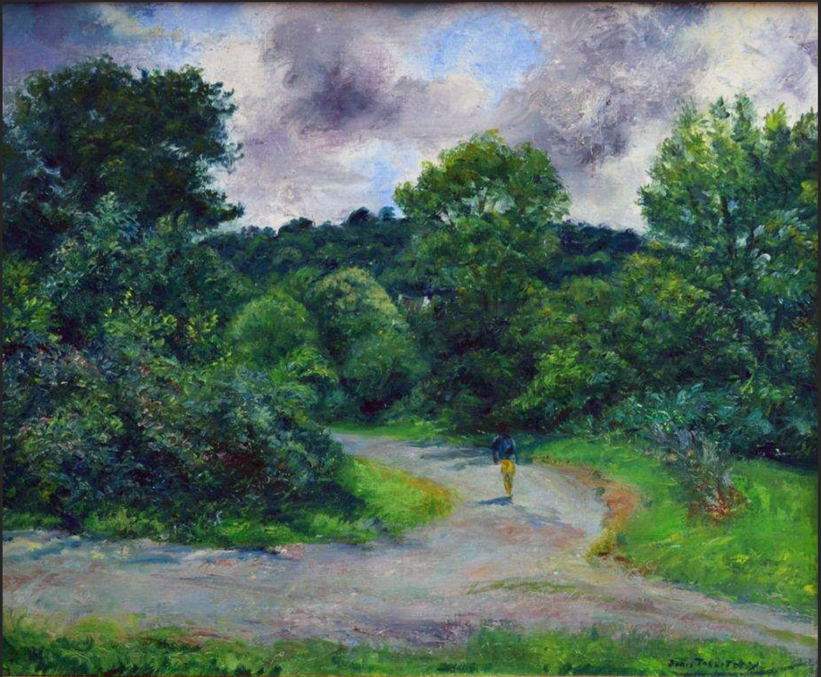
LANDSCAPE IN BRITTANY, undated, oil on canvas, 19,7 x 24 in