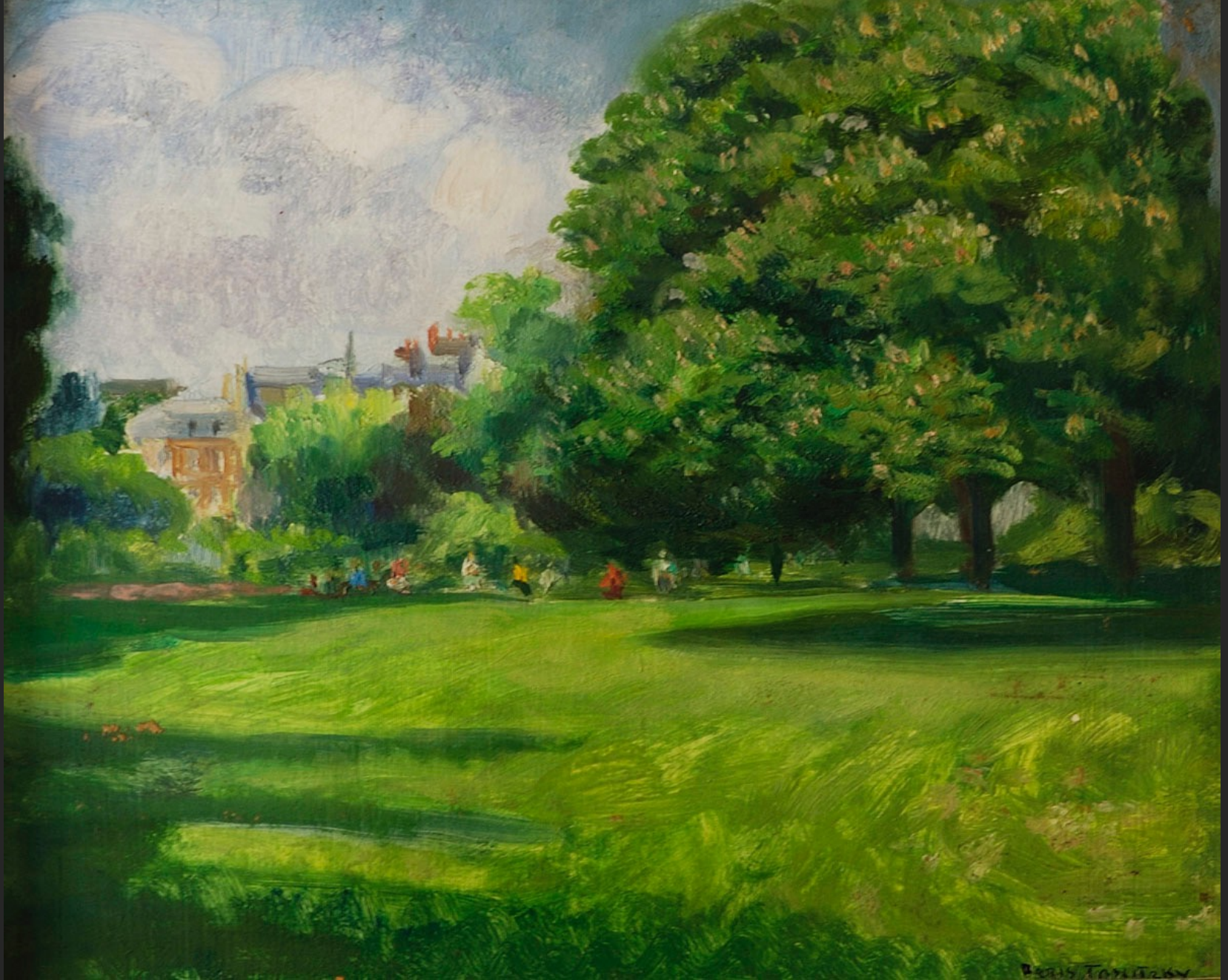
LANDSCAPE, undated, oil on wood, 8,7 x 10,6 in