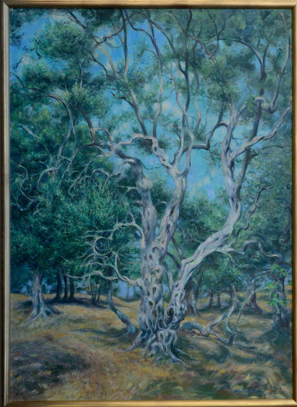
OLIVE TREES, 1982, oil on canvas, 31,9 x 23,6 in