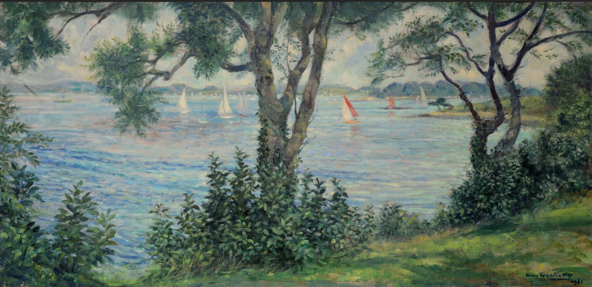
THE BLADE BOW, 1981, oil on canvas, 11,8 x 23,6 in