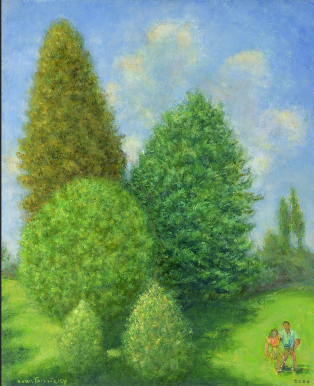
COUPLE IN A LANDSCAPE, 2000, oil on canvas, 24 x 19,7 in