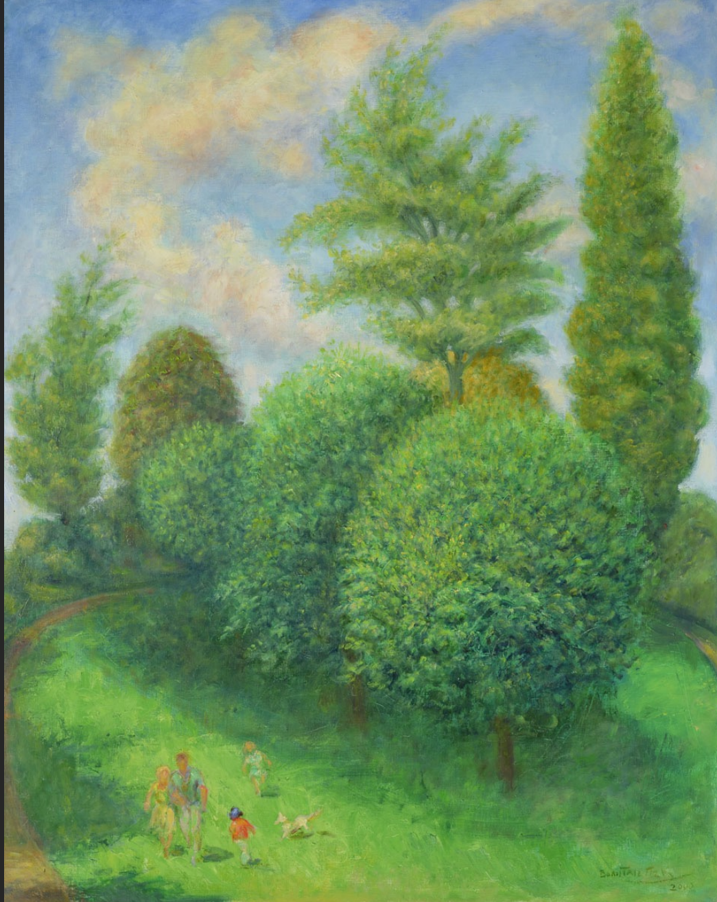
SILHOUETTES IN A LANDSCAPE (2), 2000, oil on canvas, 36,2 x 28,7 in