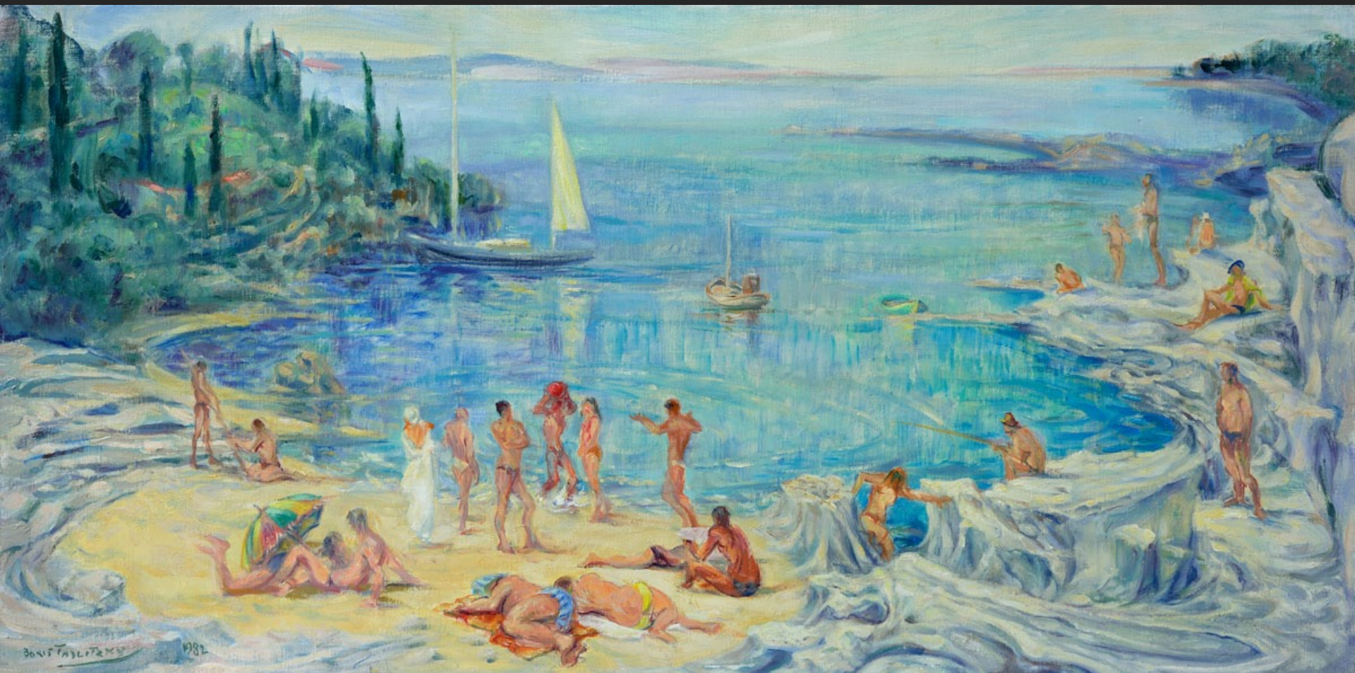
THE BEACH II, 1982, oil on canvas, 13,8 x 27,6 in