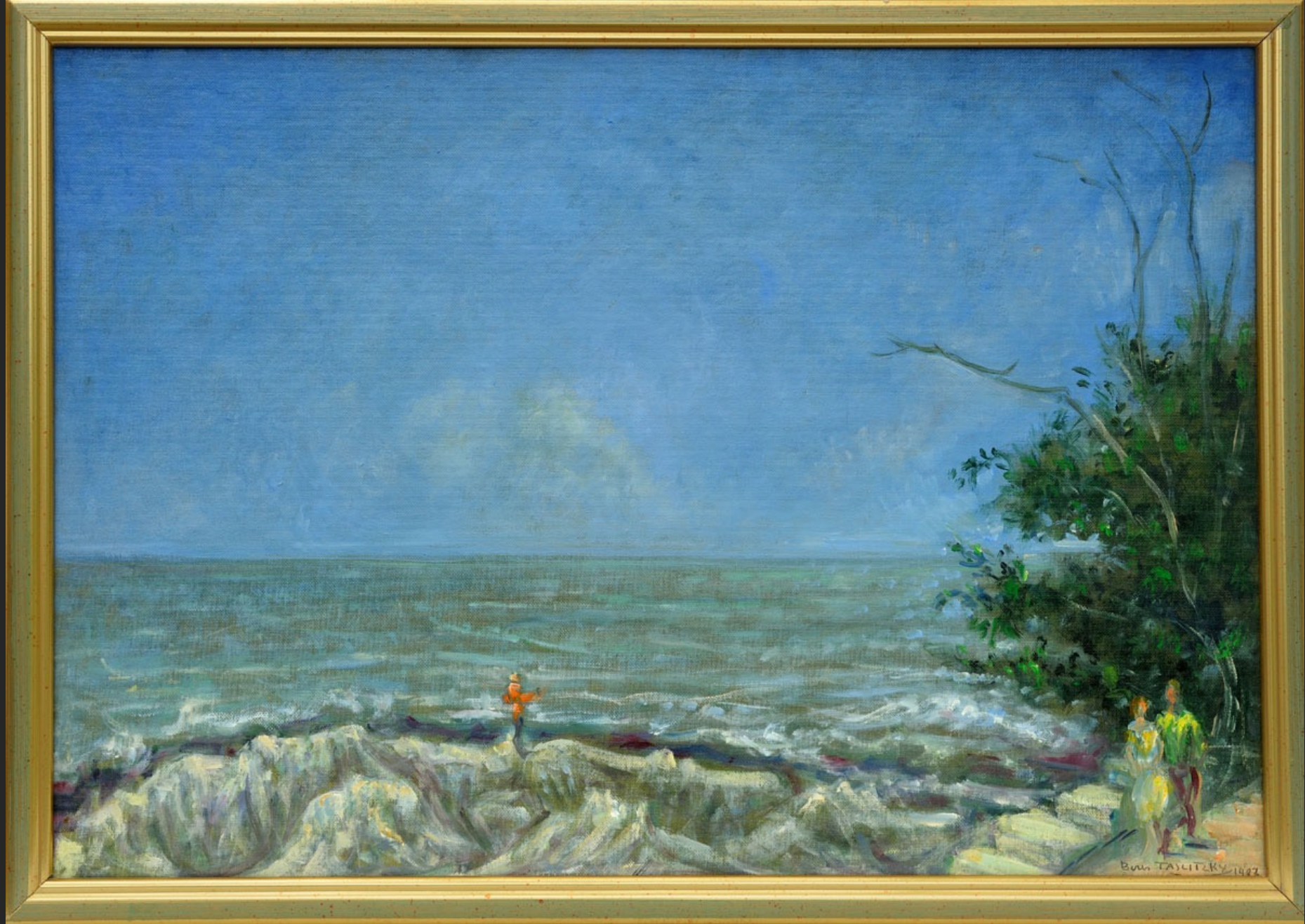
SEASCAPE, 1997, oil on canvas board, 15 x 21,7 in