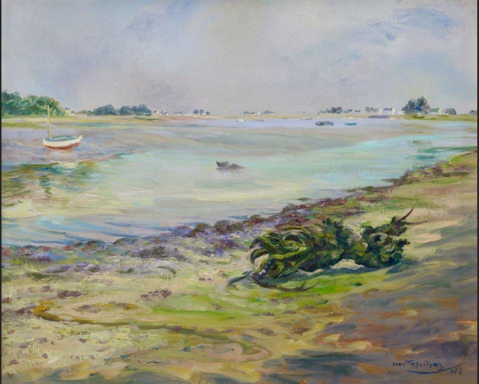
CAP-COZ LANDSCAPE, 1968, oil on canvas, 18,9 x 23,6 in