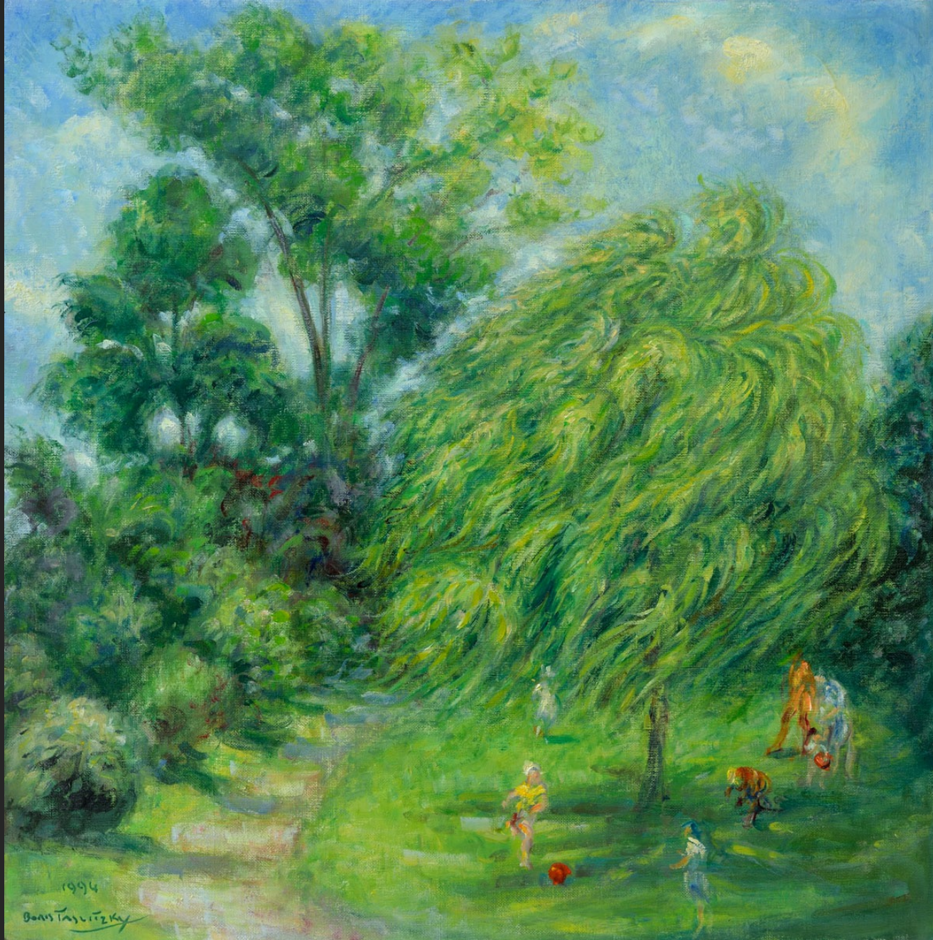
THE WEEPING WILLOW, 1994, oil on canvas, 23,6 x 23,6 in