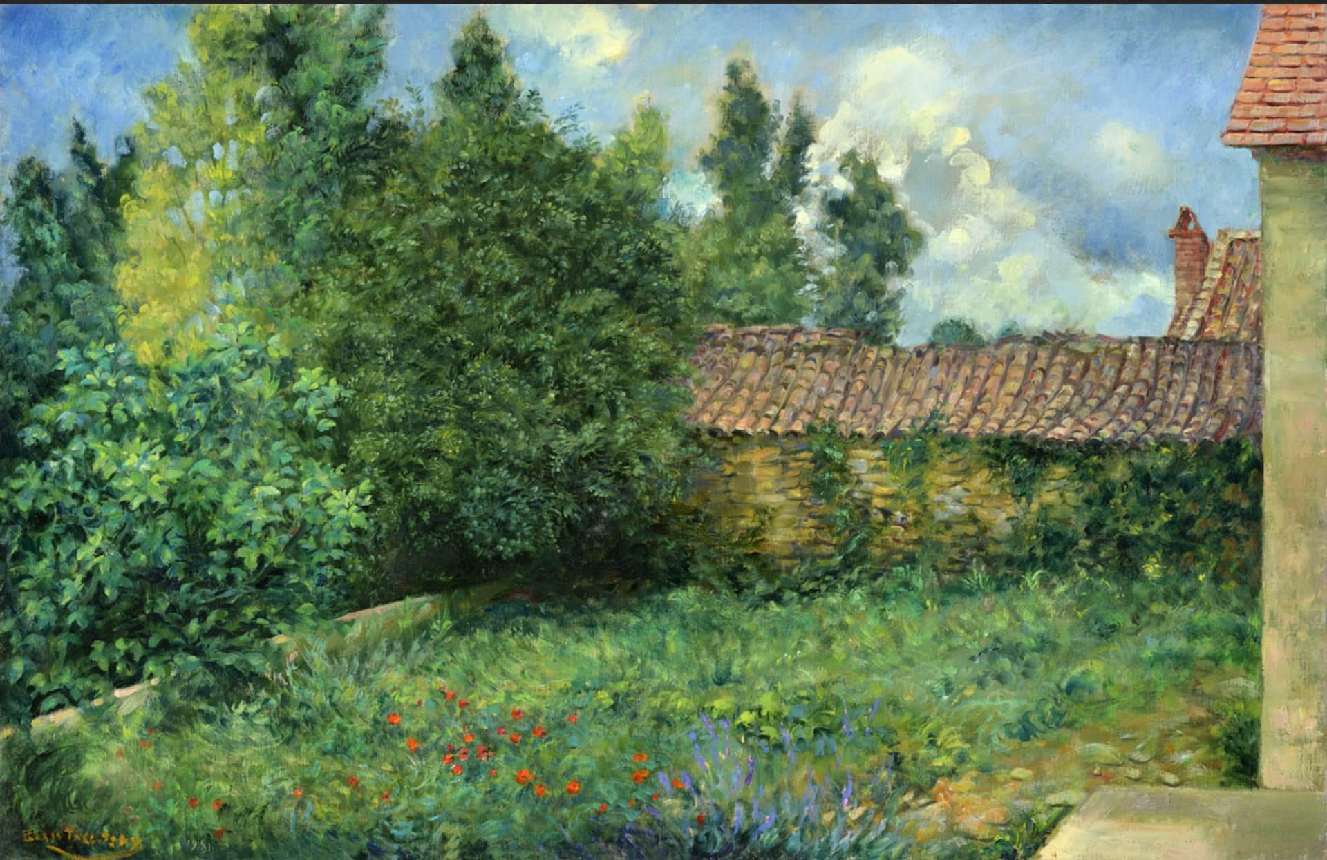
DORDOGNE, 1981, oil on canvas, 23,6 x 36,2 in